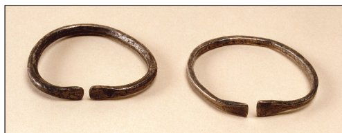
Fig. 3. 'Ring-money' from the hoard from Corran Island (Lugacaha), Lough Sewdy, Co. Westmeath.