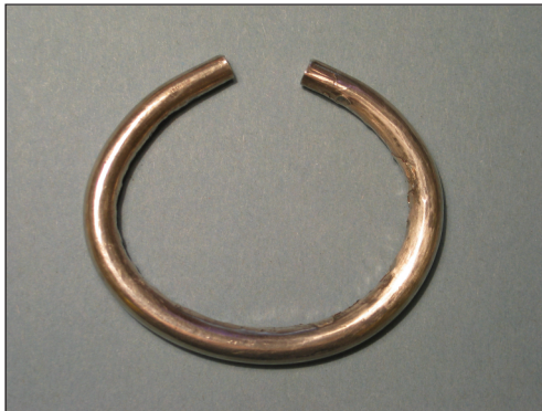
Fig. 4. 'Ring-money' from the hoard from Dunmore Cave, Mohil, Co. Kilkenny.

The final Mumu hoard containing 'ring-money' is that from Dunmore Cave, Mohil, in the kingdom of Osraige. This is a hack-silver find, which Bornholdt Collins has dated to c. AD 965 on the basis of its numismatic element (2010, 31). It comprises a single, complete example of 'ring-money' (Fig. 4), a rod, a brooch-pin fragment, a small 'droplet' of casting waste and three pieces of ingot-derived hack-silver, as well as over a dozen Anglo-Saxon coins or fragments, and it appears to have been folded within a high-quality garment, associated with belt-fittings and a series of cone-shaped 'buttons' made of woven