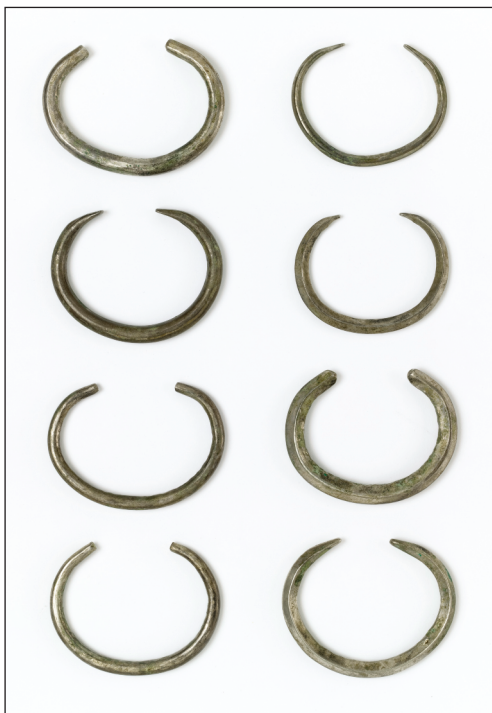
Fig. 5. The hoard of 'ring-money' from Lurgabrack, Co. Donegal.

The Lurgabrack hoard consists of eight complete examples of 'ring-money', making it the largest such find on record from Ireland, comparable in size to the hoards from Kirk o'Banks, Caithness, and Ring of Brodgar, Orkney (Graham-Campbell 1995, 129-30; 95-96). Although a coinless hoard, the presence of three rings with terminals of spatulate form indicates that it may date to the 970s, or later, for reasons referred to above. Two of its rings are virtually duplicates of one another, being made from rods of almost circular section, tapering to blunt terminals with flat ends, with almost exactly the same weight; in addition, both bear traces of hammering which were almost certainly made using the same tool. The fact that this pair stayed together suggests that it was not in circulation for very long, as does the fact that none of the rings in the hoard bear nicking. It is interesting to note that the only coin hoard from this part of Northern Uí Néill, a small deposit of Anglo-Saxon coins from Carrowen (Burt), at the base of the Inishowen peninsula, was deposited c. AD 970 (Dolley 1959), and that these two finds comprise the only post-950 hoards on record from this part of Ulster. Their location may reflect the apparent connection of a group of earlier coinless hoards in this area with the royal centre at Ailech (Purcell and Sheehan