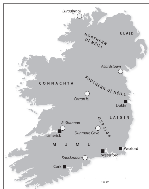
Fig. 2. Map of Ireland showing its early medieval over-kingdoms, Hiberno-Scandinavian towns and the locations of hoards containing Scoto-Scandinavian 'ring-money'.

If one were to envisage, on the basis of the available archaeological evidence, where in Ireland the occurrence of 'ring-money' is likely to be most