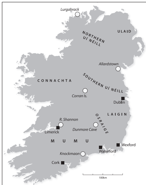
Fig. 2. Map of Ireland showing its early medieval over-kingdoms, Hiberno-Scandinavian towns and the locations of hoards containing Scoto-Scandinavian 'ring-money'.

If one were to envisage, on the basis of the available archaeological evidence, where in Ireland the occurrence of 'ring-money' is likely to be most