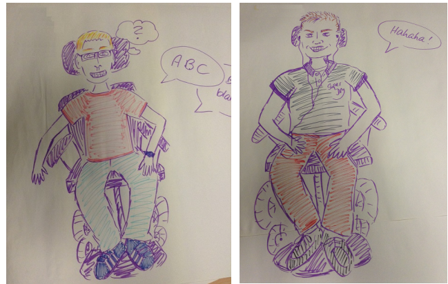
Figure 1. Examples of drawings that were produced together with study participants in Session 2.

particularly important considering the range of physical and cognitive abilities among participants.