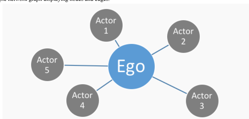
Figure 2. The example network graph displaying nodes and edges.