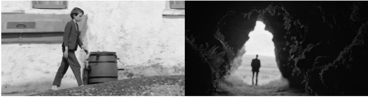
Figures 3 and 4: Heaney as a child (Colm Seoighe) wandering through the village (left) and as an adult (Michael O'Chonfhlaola) “remembering” the place of Connemara (right). Song of Granite . Screenshots.

The refrain appears on the edge, on the edge of the land, on the edge of memory, whispering in a language beyond language, opening other paths, to the other side, across the threshold—of past, of future, of space, of time, of sky, of earth; intruding between signs, between life and death, without the beginning and the end. As a (non)human polyphony of a song, it offers itself as a passage, the Natal, or Native—a little formula that seeks recognition and remains the ground of polyphony—the land and an escape; an intense centre to which territory is linked and a crack to an outside of home and the self which entails a deterritorialisation ( Thousand Plateaus 312). In diffusing itself it alters... As both a territorialising and de-territorialising force, a matter and capture of expression (a home and style), it is always in a process of undoing itself.