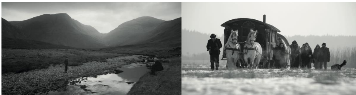
Figure 7 (left): The imaginary conversation between the child and his older self across the river in Song of Granite . Figure 8 (right): Polish Roma caravans travelling through the winter landscape in Papusza . Screenshots.

The “pockets of enchantment” in the midst of empty landscape and the still photographs of non-existing spaces carry the outside of forgetting. 4 Forgetting which, according to Papusza, saves the Gypsies, who have no memory from dying of sadness, and allows them to begin again. Forgetting that sends a man to look for all the knowledge at the bank of the river and to invite a child to make a poem ( Song of Granite ).