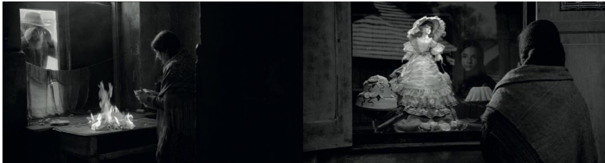
Figure 13 (left): Papusza burning her poems. Figure 14 (right): Papusza’s pregnant mother looking at the doll in a shop window. Papusza . Screenshots.

orphaned singing. They move as if by something outside themselves. “Do you feel homesick? But where is home?”, replies Heaney to the interviewer’s question. “And who is a poet?”, asks Papusza when Ficowski calls her a poet. While their situations are different, they are both what Deleuze calls the “seers,” rather than actants or agents of what happens to them ( Cinema2 ). As visionaries or “cosmic artisans” they operate upon “transversal lines” that cross, and thus unite different structures of materiality, desire and affect, accessing the nonhuman modes of consciousness, which connects them to the “whole of the universe” (Ramey 154).