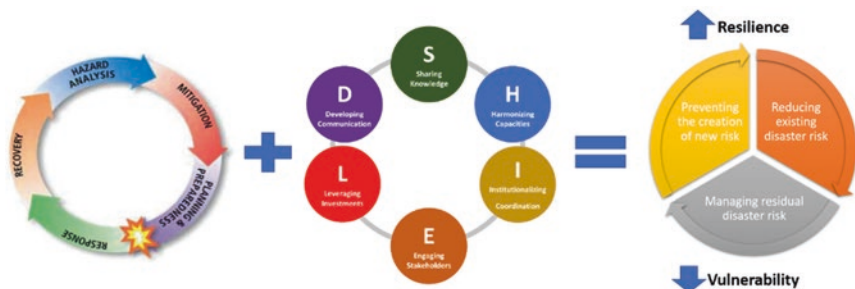
Fig. 5.4 Pathways to integration