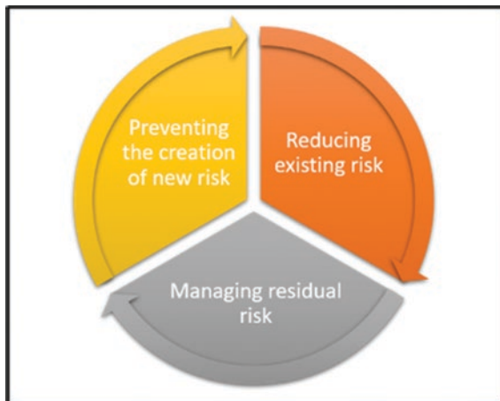
Fig. 5.1 Disaster risk management responsibilities

The research hypothesis assumes that: ‘The State has primary responsibility to prevent and reduce disaster risk, including that which is exacerbated or caused by climate change.’ It also has a corresponding responsibility to manage the residual disaster risk which cannot be prevented or reduced through feasible, affordable actions (Fig. 5.1).