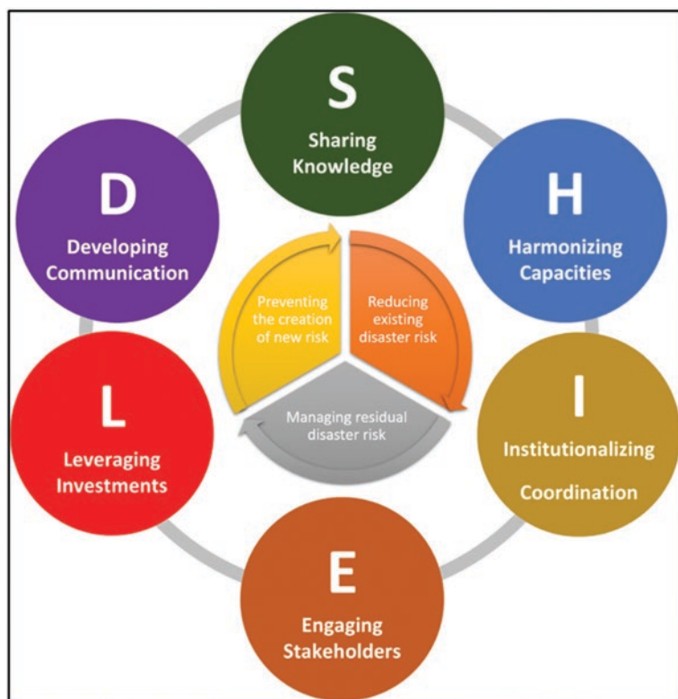
Fig. 5.2 SHIELD Model for integration of climate change adaptation and disaster risk reduction. The SHIELD pathways are relevant to all the critical responsibilities of disaster risk management, illustrated at the centre of the diagram

The EU-funded Horizon 2020 ESPREsSO Project Enhancing Risk Management Capabilities Guidelines (ERCG) (Lauta et al., 2018) proposes the SHIELD Model as a set of general recommendations for how to optimise risk management capabilities through disaster risk governance (Fig. 5.2). The pathways to integration proposed by the SHIELD Model do not necessarily include every way to enhance or achieve integration, but they summarise the most important areas for action that will contribute to a robust and effective risk governance mechanism. The research also draws on Cubie and Natoli's 'hourglass' model, as presented in Chap. 3 of this volume, on the relationship between the different frameworks for sustainable development, CCA and DRR, namely: