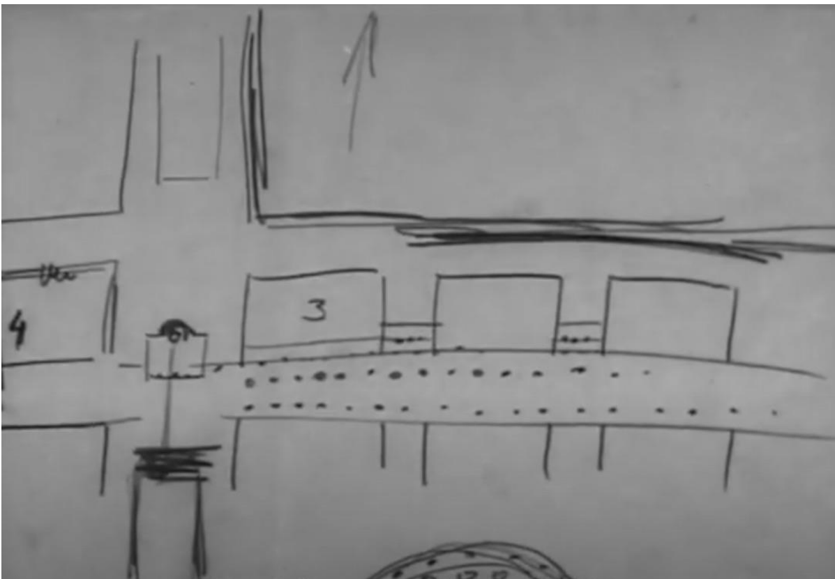
Figure 4 (above): Archival image of Hitler sketching.