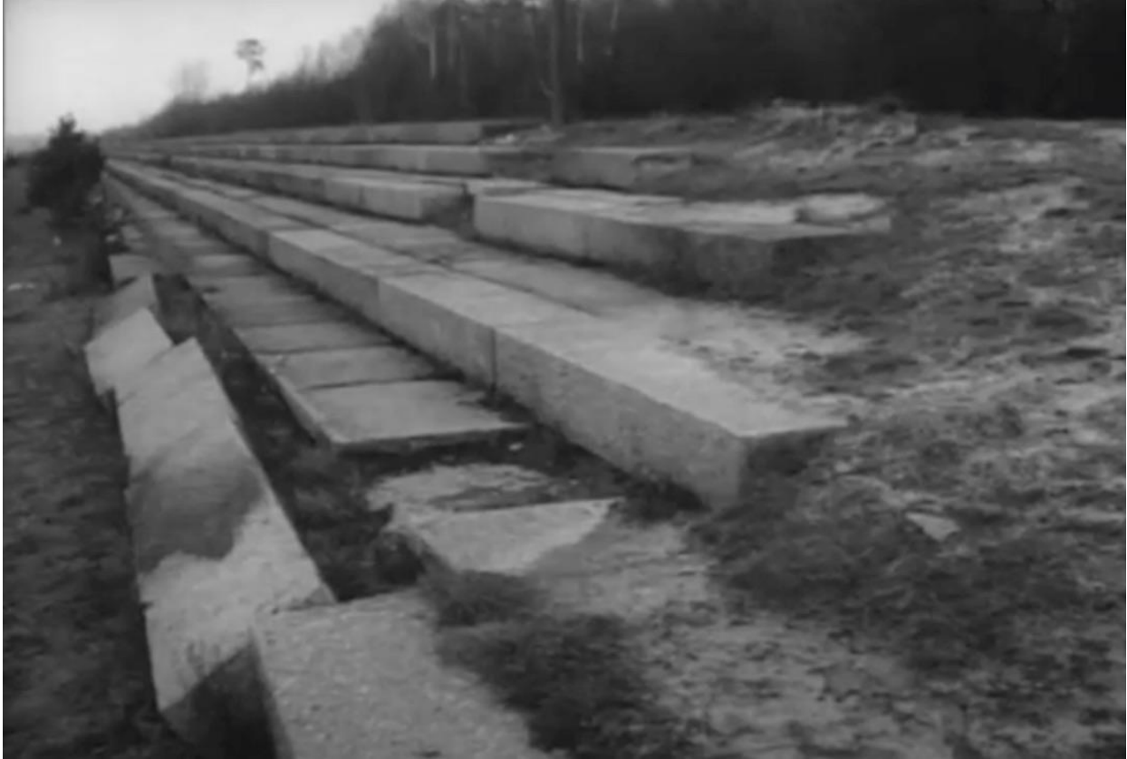
Figure 3: Dilapidated steps in Brutality in Stone . Screenshot.

As Kluge himself has said in relationship to the realities represented in his films, the films are “constructed” to offer multiple histories, narratives and possibilities of interpretation. Never one to impose an interpretation on a spectator, always preferring to create a provocation to “the film in the viewer’s head”, Kluge’s experimental process is designed to evoke, to use critic Peter Lutze’s term, an “imaginative” response. 10 In turn, if the film in the spectator’s head is determined, as Kluge has repeatedly claimed, “from the perspective of today”, the film’s meaning is located in its experience. The film in the spectator’s mind, created through Kluge’s particular montage process, becomes the real (as in authentic) history represented. As Lutze describes it in relation to The Power of Emotion (Die Macht der Gefühle, 1983) , the montage process is complex and varied, thus enabling unique and multiple possibilities for historically inflected interpretations from different spectators (115–21).