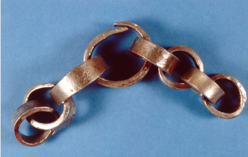
Fig. 1. 'Bullion-rings' from the 'Ireland no. 2' hoard.