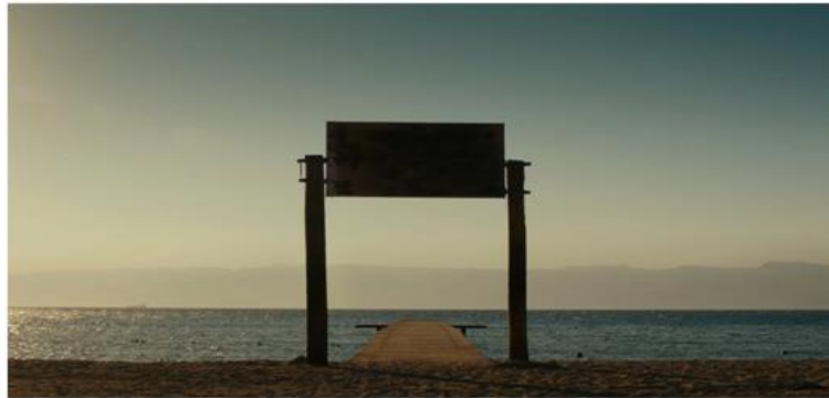
Figure 4: The gate to the pier. Production still taken from film footage.

Beach No. 3 was unremarkable and there were only two more to go. Minutes later we were at Public Beach No. 4. The pier was impossibly long, thin, jutting far out into the water. Old and battered, it seemed grossly neglected. And, as for the beach, it was almost empty, aside from some visually interesting beach umbrellas that were ripped and torn. Like with Ziad, it was the pier I had imagined. I had not imagined that it would also have a gateway—a kind of doorway—that was strangely placed as one does not need to go through it to enter the pier. Yet, that is precisely what we ended up having the father do in the film. The pier was cinematic. Anas, a talented photographer, took photos.