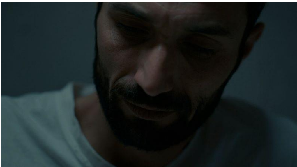
Figure 10 (top): The father gazing at Europe in Mare Nostrum . Figure 11 (middle): A look from the daughter to the father in Mare Nostrum . Figure 12 (bottom): Production still taken from film footage of Mare Nostrum . Georges Films, Synéastes Films.