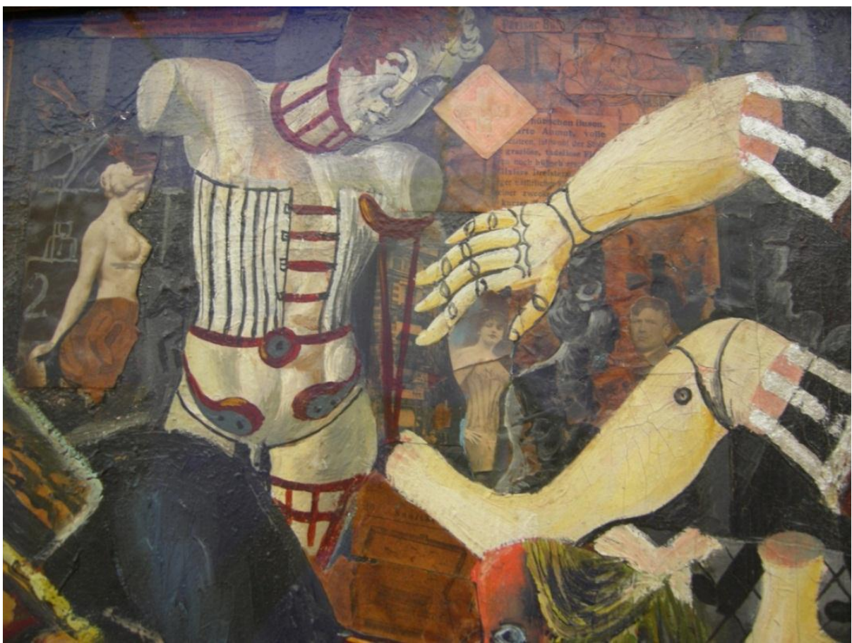
Fig. 6. Prague Street , 1920 (detail). Oil and collage on canvas, 101 cm x 81 cm, Kunstmuseum, Stuttgart. © Otto Dix/IVARO 2011.