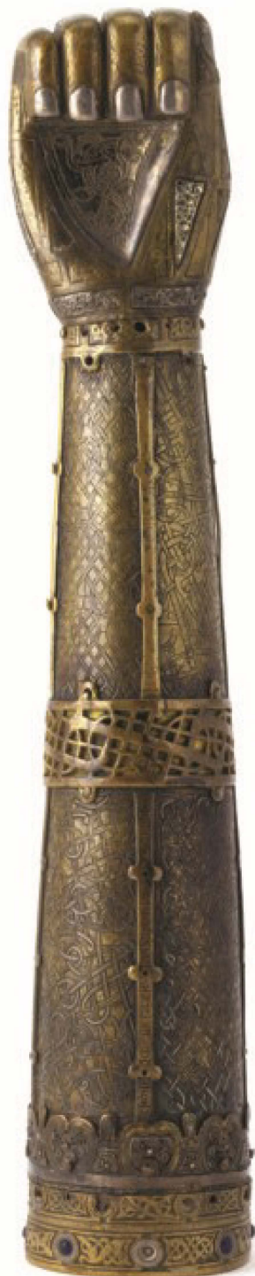
Figure 4. St Laichtín's arm, Donoughmore, Co. Cork.

suggesting that its adoption in Ireland was as a result of more direct contact with Scandinavia. This is also supported by the decorated wooden handle recovered from a late 11th-century house on Fishamble Street, Dublin, which has been compared directly with objects in Sweden and Norway by Lang (1988, 27, 47) and in Gotland by Uaininn O'Meadhra (2015, 395).