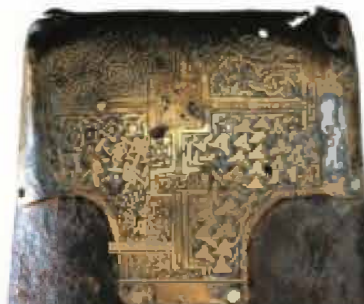
Figure 1. Bearnán Conaill from Inishkeel, Co. Donegal, applied decorative copper-alloy plate featuring ring-chain.

art, the question of why there was such a late adoption of Viking art across Ireland is only beginning to be asked (Graham-Campbell 2013, 77). I have previously argued that secular and ecclesiastical politics, and related issues of identity, have had a significant influence in this regard (Murray 2015). In this paper, I wish to advance that argument further, using the evidence of Irish Christian metalwork, by looking in particular at the influence that politics may have played in changing Irish attitudes towards Viking art.