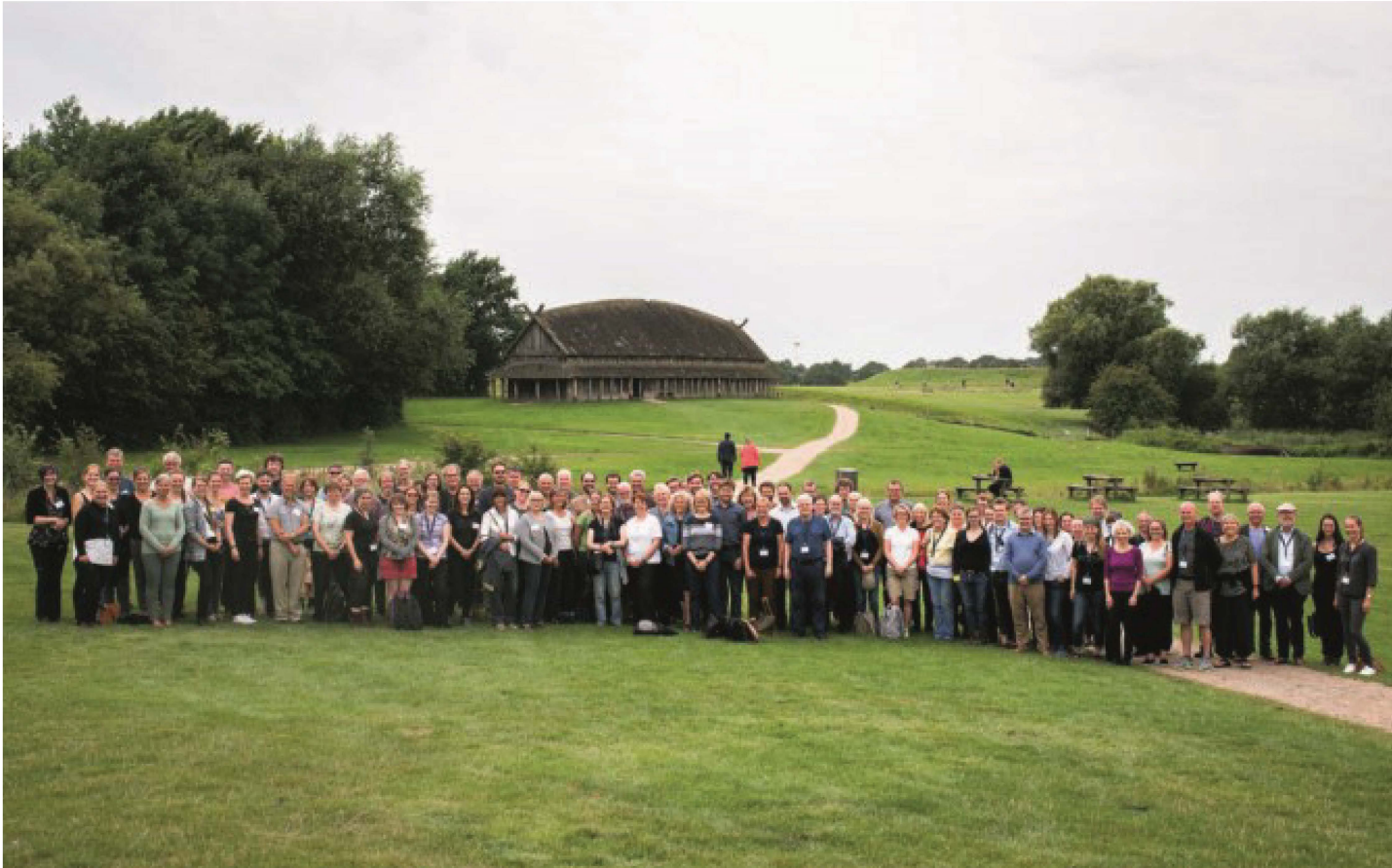
Delegates of the 18th Viking Congress assembled at the Trelleborg ring fortress.