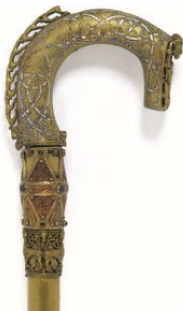
Figure 2. Crosier from Clonmacnoise, Co. Offaly.