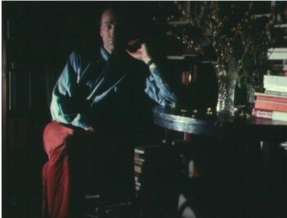
Figure 8: Closing image of the first chapter of Jonas Mekas's As I Was Moving Ahead Occasionally I Saw Brief Glimpses of Beauty (2000). Screenshot.

As Godard and Miéville asserted in The Old Place (2000), an essay film commissioned by MoMA about the origins of artistic creation where they reconfigure many of the images of Histoire(s) du cinéma (Godard, 1988–1998), “the artistic work not only consists of observing, collecting experimental data, and then drawing out a theory, a painting or a film. The artistic thinking starts with the invention of a possible world or a fragment of a possible world, to confront it with experience and work”. The essayistic form in film shows the tension between experience and work and sets a strange border—to use Bense’s words—between the theoretical and creative thinking to trace proximity and tension between them. “That eternal dialogue between imagination and work”—as Godard and Miéville continue arguing in The Old Place —“enables the consolidation of a keenest representation of what has been agreed upon to call ‘reality’”.