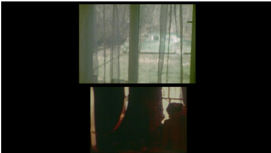
Figure 3: Carolee Schneemann at the editing table in Kitch’s Last Meal (1976). Screenshot.

We claim that the appropriation of technical tools is fundamental to enable practice-led research on filmic forms and it expands the possibilities of a creative documentation by filmmakers around their own creative practice. In a moment of the film where Schneemann strings together shots of herself and her partner, the artist Anthony McCall, she answers his question regarding the certainty of the type of film she wanted to make. She alludes to editing as the longest procedure in her process, and refers to “evidence”, collected in the form of notes, drawings or dreams, that have shown her that despite the transformations that her “potential imagery” go through in the process of their making, the “original seeds” of the idea are usually contained in the final work: “I discover what the piece is going to be in the process of making it. But then, what happens is that it often contains all the original seeds, which by then I’ve kind of forgotten”. 4 Thus the revision and composition of the material on the editing table is established as the procedure in which to observe the transformation of images in their gestational processes, both in their fragility and fecundity.