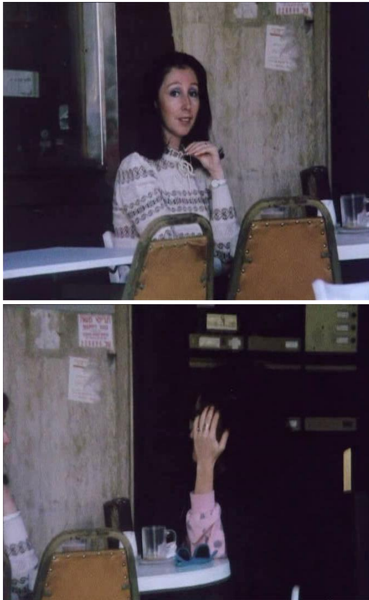
Figures 4 and 5: Perlov’s gaze is interrupted when one of the women he films blocks the point of view of his camera. Diary (Yoman, 1973–1983), Chapter 2 (1979–1980) . Screenshots.

continuously needs to see in order to assess, to assess in order to choose, to consider the possibilities and discard. In a shot where he attempts to film two women in a café in Tel Aviv the filmmaker affirms: “Beauty and ugliness still don’t affect me: it is only in the gestures that I find sometimes an interest. At the Polish Café, I don’t even hear their voices, their language. It is like drawing a rough draft”. Perlov finds through the visor of the camera the gestures that produce the desire to capture an image: “These two girls. I enjoy looking at them. They are natural. I want to watch them more and more”. It is evident that the presence of the camera generates discomfort in both women, to the point that one of them changes her place to block the point of view of the camera with her back.