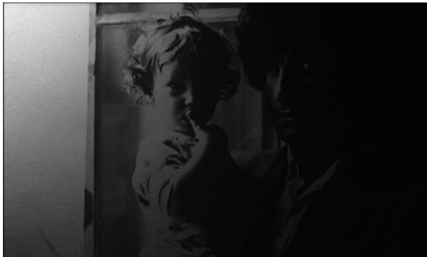
Figure 6: A photo of Philippe Garrel carrying his child in She Spent So Many Hours Under the Sun Lamps ( Elle a passé tant d’heures sous les sunlight ). G.I.E., 1985. Screenshot.