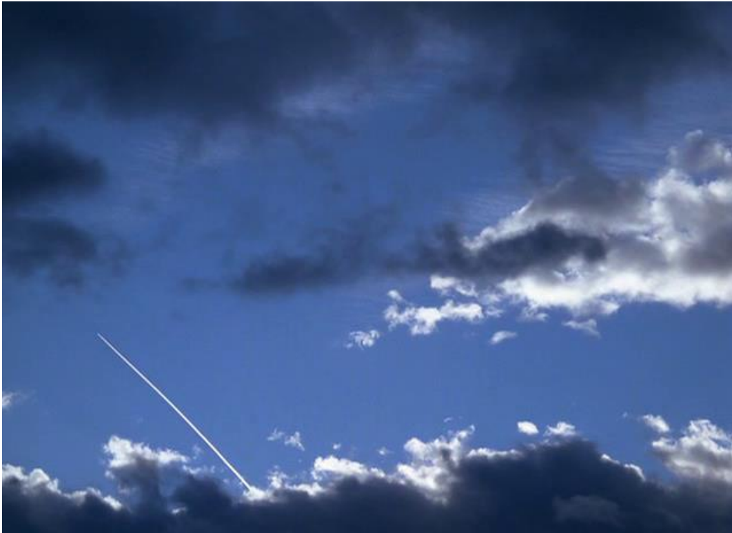
Figure 1: The opening of Jean-Luc Godard's Passion . Sonimage, 1982. Screenshot.