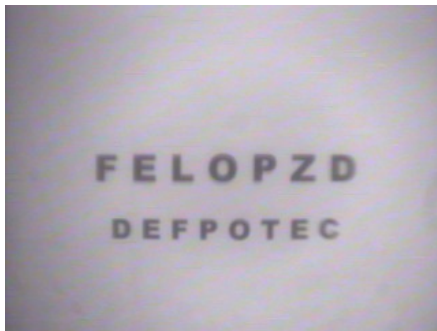
(e) F_g = 0.0 D (Clear image)