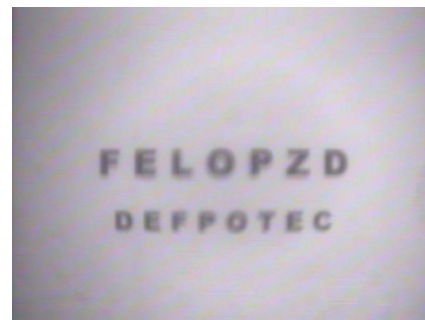
(d) F_g = -1.0 D