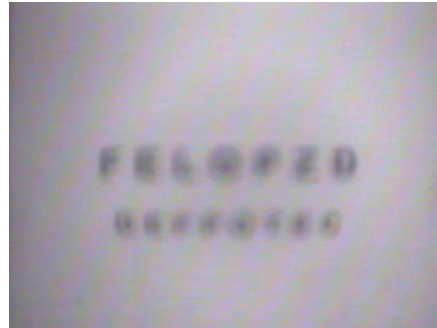
(b) F_g = -3.0 D