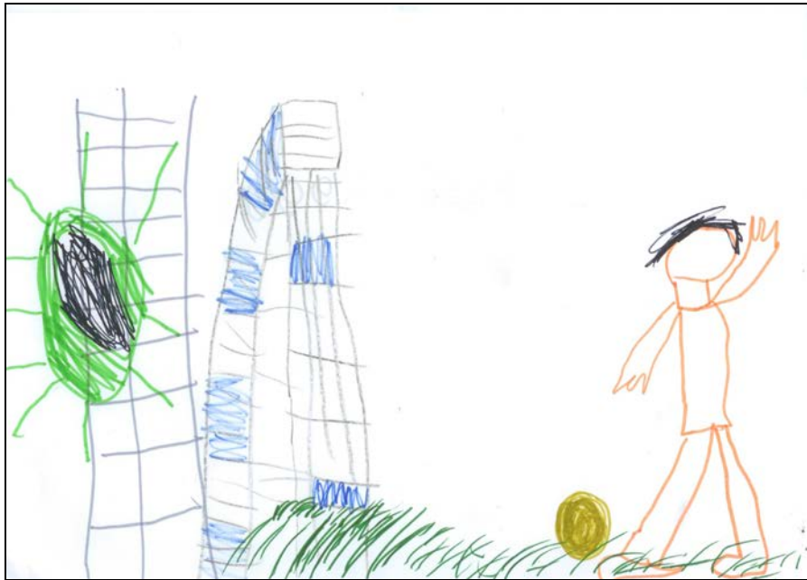
Figure 1: 'My life' by Bart, aged 7, moved from outside Europe

However, while two of the girls (both sisters) presented sport, including competitive team sports, as central to their identities, none of the others did. The younger girls tended to mention their involvement in sport in passing, as one of a range of activities in which they were involved. For example, Figure 2 is a self-image by Michelle, aged 11. It includes representations of her interests in swimming and cycling, alongside her other hobbies (reading, writing and so on).