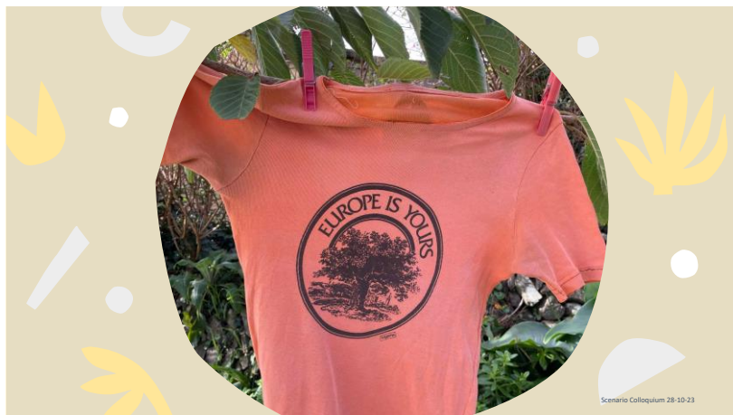
Figure 3: “Europe is yours”-T-Shirt

Traveling across Europe feels different to my student days when I often wore a T-Shirt with “Europe is Yours” imprinted on it (Fig. 3). My first travels by rail and car I found highly exciting. While Interrail passes were relatively affordable, traveling by plane was very expensive at the time. When on a rare occasion I could afford a flight and the cabin crew member made announcements in the language of country X, I listened attentively to the sounds of that language. Picking up these sounds was a first attunement to the other culture and increased my anticipation of the time that I would spend there.