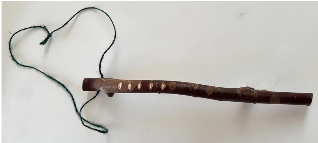
Figure 1: A wooden stick used as a prop in a workshop

The participants, all of them experienced drama and language teachers, came up with impressive performances. One group, for example, set the scene in an Asian country and turned the prop into a sacred object in a fake shamanistic ritual for gullible English tourists.