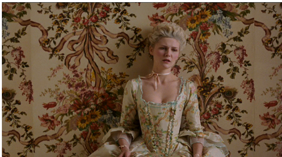
Figure 1: Identifying with Marie-Antoinette as the vulnerable object of the gaze. Marie Antoinette (Sofia Coppola, 2006). Sony Pictures, 2006. Screenshot.