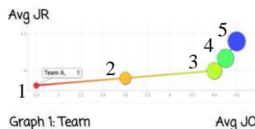
Fig. 2. The two axes (JO and JR) and representation of the evolution of team common ground

Data visualization. We use Google motion chart to show the evolution of the common ground. We can obtain three dynamic graphs: (a) the perception of each team member, (b) the perception of the team and (c) the perception of the team and the team coach. In each dynamic graph, the X axis of the first graph represents the average of team members' Joint Objectives at time t, the Y axis represents the average of team members' Joint Resources at time t, whereas the bubble size represents the variance of JO. Figure 2 shows how a team starts with a low amount of Joint Objectives and Joint resources (point 1, in the bottom left corner), increases its amount of JO (points 2 and 3), and it finally increases its amount of JR (points 4 and 5). Each point is associated to a set of data collected at a specific time.