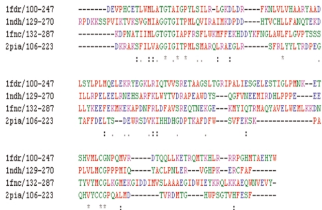
Figure 1. A multiple alignment of four oxidoreductase NAD binding domain protein sequences. Residues are coloured according to the following criteria: AVFPMILW are shown in red, DE are blue, RHK are magenta, STYHCNGQ are green and all other residues are grey. The residue range for each sequence is shown after the sequence name.