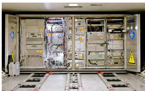
Fig. 1. CARIBIC container (1.6 tons), 15 instruments in 9 racks, ~ 100 trace gas species and aerosol parameters, 13 European institutions (6 countries), 1-2 flights per month.

The UTLS is routinely sampled by the IAGOS-CARIBIC program (Civil Aircraft for the Regular Investigation of the atmosphere Based on an Instrument Container, www.caribic-atmospheric.com ), a large scale European infrastructural program with the aim of studying global climate change, in particular the chemistry and transport across this part of the atmosphere [3]. A container (Fig. 1) with 15 different automated instruments from 8 European research partners is currently flying on board a commercial Lufthansa aircraft A340-600 since 2005 to monitor about 100 atmospheric species (trace gases and aerosol parameters) in the ULTS. CARIBIC has already completed more than 434 flights across the globe (Fig. 2).