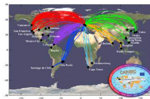
Fig. 2. CARIBIC flight routes from May 2005 to February 2016 (434 flights).