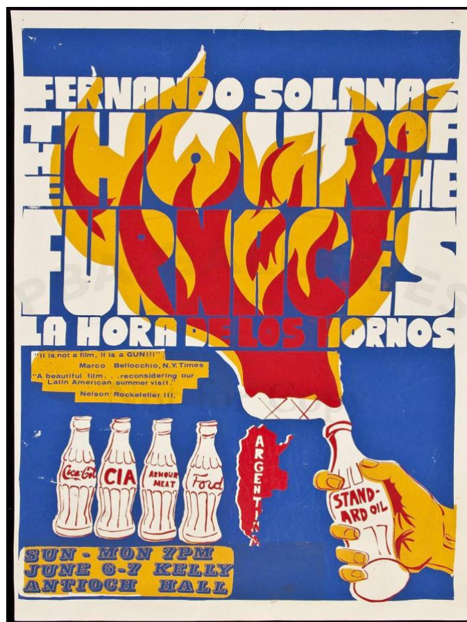
Figure 1: La hora de los hornos ( The Hour of the Furnaces , Fernando Solanas and Octavio Getino, Grupo Cine Liberación, 1968). US Poster.