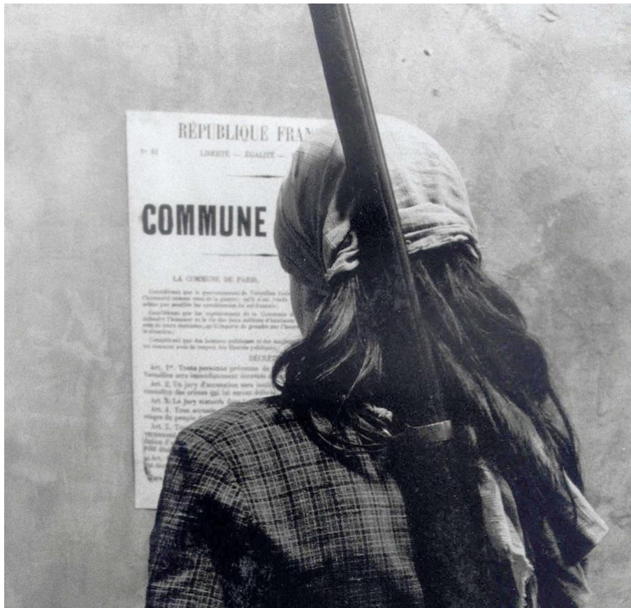
Figure 3: La Commune (Peter Watkins, 2000). Production still.

(Groys 4) where the new must be shaped accordingly to “reintroduc[e] [the whole of] mankind into the world” (Fanon 105).