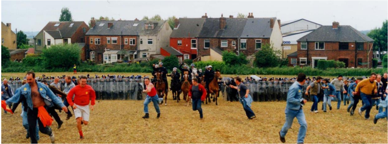
Figure 4: The Battle of Orgreave (Jeremy Deller, 2001). Production Still.

share the common goal of desublimising history through the reactivation of political unrest, by revisiting crucial moments of defeat for the oppressed. If Watkins’s film is a thorough exploration of the dialogical dimension of arguably the first proletarian revolution in Europe, the Paris Commune of 1870, which ended with the slaughtering of over thirty thousand Communards (Wayne, “Tragedy” 62), Deller’s project explored the clash between miners and policemen that took place in Orgreave in 1984 as one of the most violent episodes of repression against the miners prompted by Thatcher. These two projects engage with an idea of the present as a realm of constant conflict, and of memory of past struggles as the fragmentary locus that may encourage political action in the future. 8 But more importantly, both of them take filmmaking as a research practice that spans in time to give space for more complex and stronger political awareness—for practitioners, collaborators and potential audiences. Filmmaking appears as a social research practice that intervenes, through specific strategies towards history, memory, technology and collective action, in the construction of a diverse, plural, and always-in-dispute public sphere.