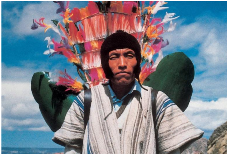
Figure 2: La nación clandestina ( The Secret Nation , Jorgé Sanjinés, Ukamau, 1989). Production still.

The idea of film-act developed throughout the clandestine life of La hora de los hornos ( The Hour of the Furnaces , Solanas and Getino, 1968) is seminal for this consideration of experimentality. The overriding performative character of the film, for which Solanas and Getino encouraged rearranging its parts according to the goals of each screening, defined the film as a “pretext for dialogue, for the seeking and finding of wills” (Solanas and Getino, “Towards” 248). This openness was thus a consequence of the quest for specific social dynamics during the projections—seeking the consciousness-raising of the audiences faced with their own colonial history of subjugation—and not an outcome derived from formalist counter-strategies of estrangement. In this way, and despite the nonformalist approach to the idea of open structure, it had a formal impact on the filmic experience and on the film text: intertitles were added to warn audiences, a dialectic between continuity and interruption was constantly at play, projected images and heated discussions were part of the film event, etc. In short, an expanded sense of film form was the consequence of practical and political goals.