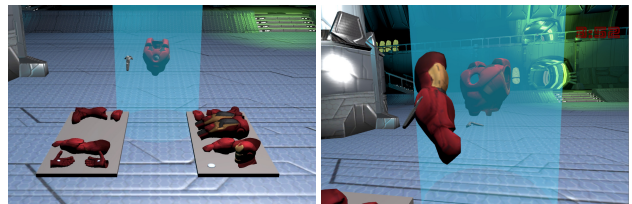
Figure 1: Two screenshots of the VR game.

According to Roseman's theory, the situational state appraisal variable permits to distinguish joy and frustration. More precisely, circumstance-caused events inconsistent with personal motives are