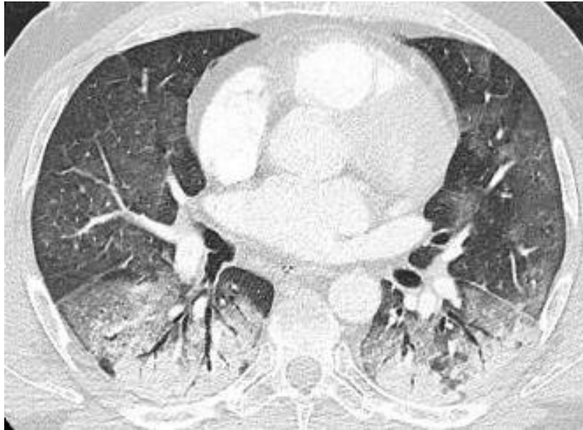
Image from CTPA of patient 2 showing diffuse pulmonary opacification demonstrating an anterior to posterior density gradient with diffuse ground-glass opacification in the anti-dependent portion