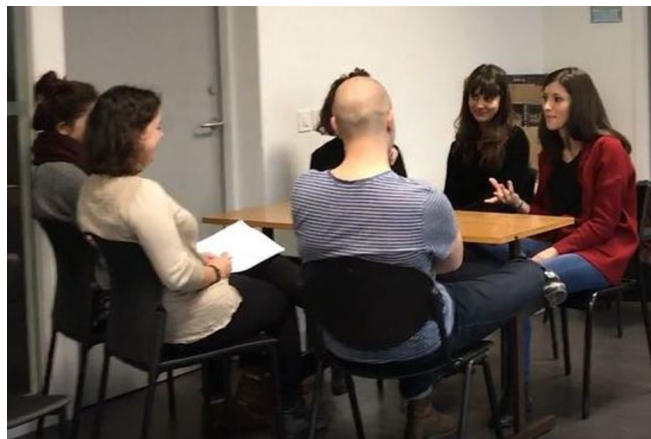
Figure 6: Hand movements

especially when she is looking for a word or trying to explain it (Fig. 6 and 7) or when she wants to insist on a concept and/or word (Fig. 8).