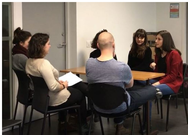
Figure 8: Hand movements