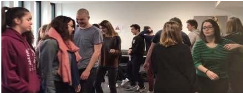
Figure 2: Walking to wake up your body

These students are used to playing roles and being put in situations of communication through drama in their English classes, so they know how important the preparation phase is. My drama classes always start with physical and vocal warm-up exercises (walking, stretching, vocalizations – Fig. 2) to engage in team building activities.