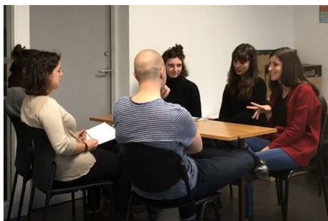
Figure 7: Hand movements