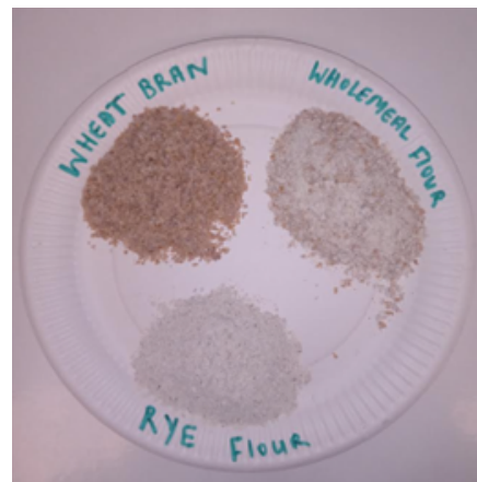
Figure 4: Traditional fibre enriching ingredients (wheat bran, wholemeal flour, rye flour)