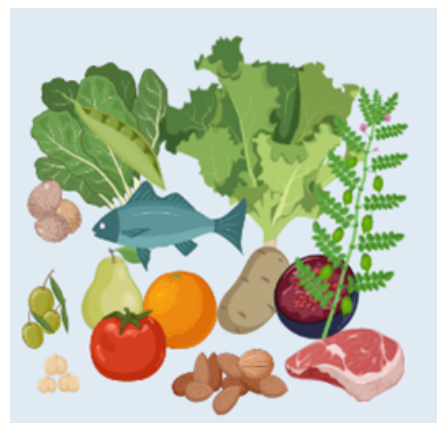
Figure 2: An ancestral-style diet (designed on Biorender Software)