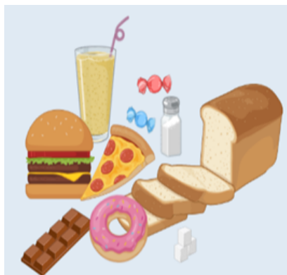
Figure 1: A Western-style diet

Today, many people in Ireland and other industrialised nations consume what is referred to as a Western-style diet. This diet is high in processed foods such as white bread, biscuits, cakes, and processed meats (including sausages and bacon) and subsequently low in fibre rich foods such as fruits, vegetables, nuts, and legumes which represented substantial components of the diets of our ancestors (see Figures 1 and 2).