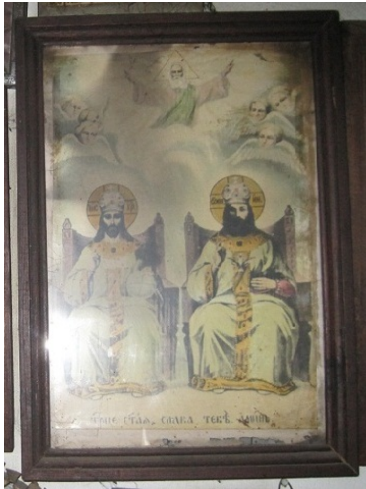
Figure 3. Photograph of a mass produced lithograph icon with Inochentie enthroned in heaven next to Christ with a dove at his breast symbolising the Holy Spirit. This photograph was taken in the home of an Inochentist in the village of Lipetcoe, Ukraine.

Such images (see Figure 3.) became widespread and exist in multiple variants in the homes of Inochentists today. Archimandrite Antim Nica, who was sent as a Romanian Orthodox missionary to the area around Balta when it was occupied by Romania during the Second World War, 13 observed that “the image of Inochentie, in painted or photograph form, can be seen in Transnistria in many Moldovan families, placed between icons in the East corner of the house” (Nica, 1942: 41) and adding later that “More clearly than in their pious writings, the beliefs of Inochentists are reflected in their iconography” (Nica, 1942: 47). 14