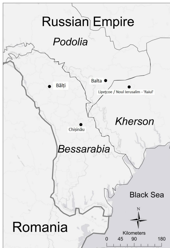
Figure 1. Map showing the place of origin of the Inochentist movement on the border between the Russian provinces of Podolia, Kherson and Bessarabia.