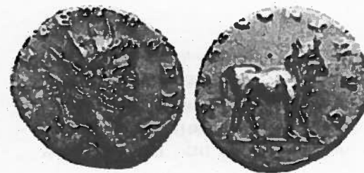
FIGURE 2. Coin of Gallienus with bull image.

goddess. 18 So, for example, the coin which bears the (expanded) legend LIBERO P[ATRI] CONS[ERVATORI] AVG[VSTI] depicts a tigress, while the type which bears the legend IOVI CONS[ERVATORI] AVG[VSTI] depicts a goat. In some cases, though, several different reverse types are associated with the same god. So, for example, the coins dedicated to Hercules depict either a lion or a boar. Again, the coins dedicated to Sol, those which bear the legend SOLI CONS[ERVATORI] AVG[VSTI] , depict either a winged horse or a bull, and it is the latter type which is of interest to us here (Figure 2). 19