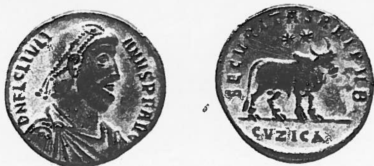
FIGURE 1. Coin of Julian with bull image (ANS 1944.100.21966), not to scale.

with a depiction of the personification of this concept. This personification had consisted of a lady holding a scepter and either sitting on a throne or leaning against a column. 3 The use of most such traditional personifications fell into increasing disfavor from the reign of Constantine I (306–337) onwards, resulting in some noticeable new reverse types. In addition to some coins of the traditional type, Constantine's reign also witnessed, for example, the issue c. 325–27 in the name of his mother Helena of coins bearing the legend SECVRITAS REIPVBLICE [sic] in association with a standing female figure lowering a branch ( RIC 7 passim ). 4 Others simply depicted the emperor himself, in military guise and often accompanied by his sons, 5 while others again, some small bronzes issued c. 336–37 in the name of Constantine's nephew and Caesar Hannibalianus, bore the legend SECVRITAS PVBLICA and depicted the personification of the river Euphrates reclining on the