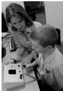
Figure 5. A child receiving visual feedback therapy with a portable training unit.

In the past, the frequency and location of EPG therapy sessions were determined by practical considerations, such as the distance to be travelled in order to attend therapy. Frequent practice of new articulation patterns using EPG for feedback was often impossible for those living at a distance and therapy was sometimes discontinued because it was too far for children to attend on a regular basis. A device that has proved successful in overcoming this practical difficulty has been the EPG portable training unit (Fujiwara, 2007; Gibbon, Stewart, Hardcastle, & Crampin, 1999; Jones & Hardcastle, 1995). The major design features of these units are that they are small, comparatively inexpensive, lightweight and simple to operate. The portable units allow visual feedback therapy to take place close to, or in, children's homes, so increasing opportunities for practice and avoiding the need to travel long distances for therapy sessions.