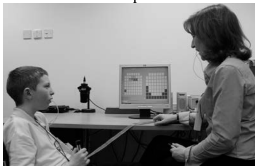
Figure 4. A typical EPG therapy session. The clinician and child both wear EPG plates and are connected to the computer display. The EPG pattern on the right shows a static therapy target for a typical velar sound, /k/. The child is attempting to copy this velar pattern. The display on

During a typical EPG therapy session, a child and a clinician sit side-by-side in front of a computer screen, as shown in Figure 4. New versions of software give the clinician flexibility in terms of the amount of information and the content of the EPG screen displays. Usually the screen shows dynamic (i.e, real time) and static displays alongside each other, as in Figure 4. EPG has the facility for two multiplexers to be connected, one for the child and one for the clinician, with a switch to toggle between the two. When the clinician is connected, it is possible to demonstrate normal contact patterns on the dynamic display. When children are connected to the EPG equipment, they can see their own tongue contact patterns. It is also possible to capture or freeze a target pattern onto the static display. A target pattern for a velar articulation is shown on the right hand side of the computer screen in Figure 4. Pre-recorded target static patterns can be stored in the computer and retrieved when needed.