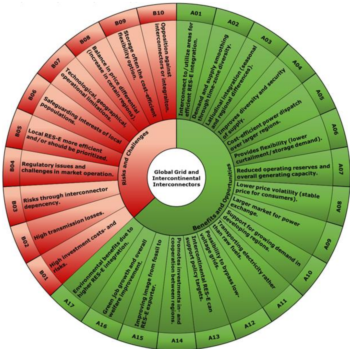
Figure 2 Overview of mentioned benefits, opportunities, risks and challenges for a global grid and/or intercontinental interconnectors within the literature. The outer ring corresponds to further description of the benefits and opportunities (A) and risks and challenges (B) within this section.