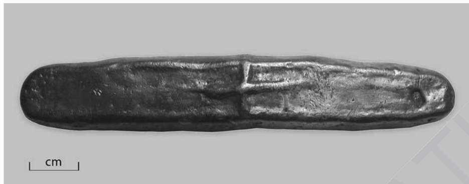
Fig. 6.4. Cross-marked ingot from Newry, Co. Down.

there are also two moulds for producing such ingots on record from there. One of these, in sandstone, is from Knowth/Cnóbha (Barton-Murray & Bayley 2012, 531, fig. 7.4:8), a royal site of Brega, in Southern Uí Néill, with strong Hiberno-Scandinavian connections (Wallace 2012). It would produce a large, broad ingot, of the same general form as the Cuerdale examples and, like the Cuerdale and Newry ingots, with a centrally positioned raised cross. The other occurrence is a soapstone mould from the excavations at Christchurch Place, Dublin (Fig. 6.5) (National Museum of Ireland registration number E122:16967), unfortunately broken, which would have produced a short, but thick and broad, cross-marked ingot.