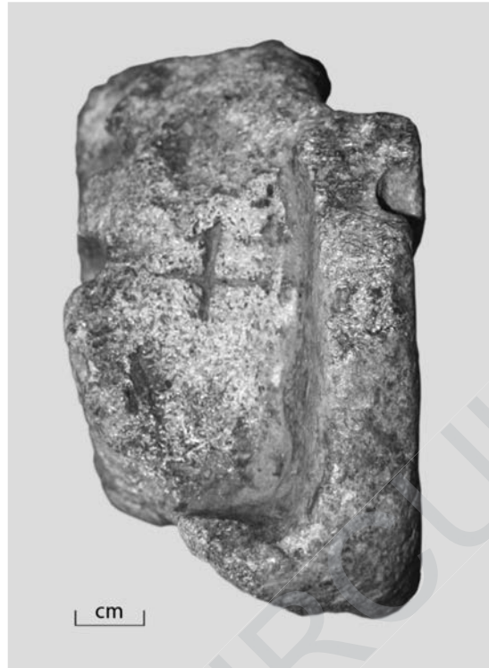
Fig. 6.5. Soapstone mould for a cross-marked ingot from Christchurch Place, Dublin.

series of penannular brooches which were subsequently adopted and elaborated by the Scandinavians, while other quantities were presumably used in royal trading, tribute and gift-exchange. In this chapter, however, the evidence of literary sources is used as a platform for exploring the investment of silver wealth by kings in the patronage of the ecclesiastical sphere, with which they often had intense familial connections. Even though hoards are sometimes found on ecclesiastical sites, and thus represent this phenomenon archaeologically (as may the cross-marked ingots), it may be assumed, given the recent recognition of the magnitude of ecclesiastical estates in Ireland during the Viking Age, that some of the hoards associated with ringfort-type settlements actually represent ecclesiastical, rather than secular, wealth. Indeed, given the strong bond that existed between secular and ecclesiastical powers in early medieval Ireland, it may be challenging to distinguish between the wealth of the two. This bond, within the context of Viking Age silver, is illustrated by the powerful Clann Cholmáin of Mide. It is unlikely to be coincidence that this dynasty, on the evidence of the hoards the wealthiest in Ireland, was also the one that invested so heavily in church patronage.