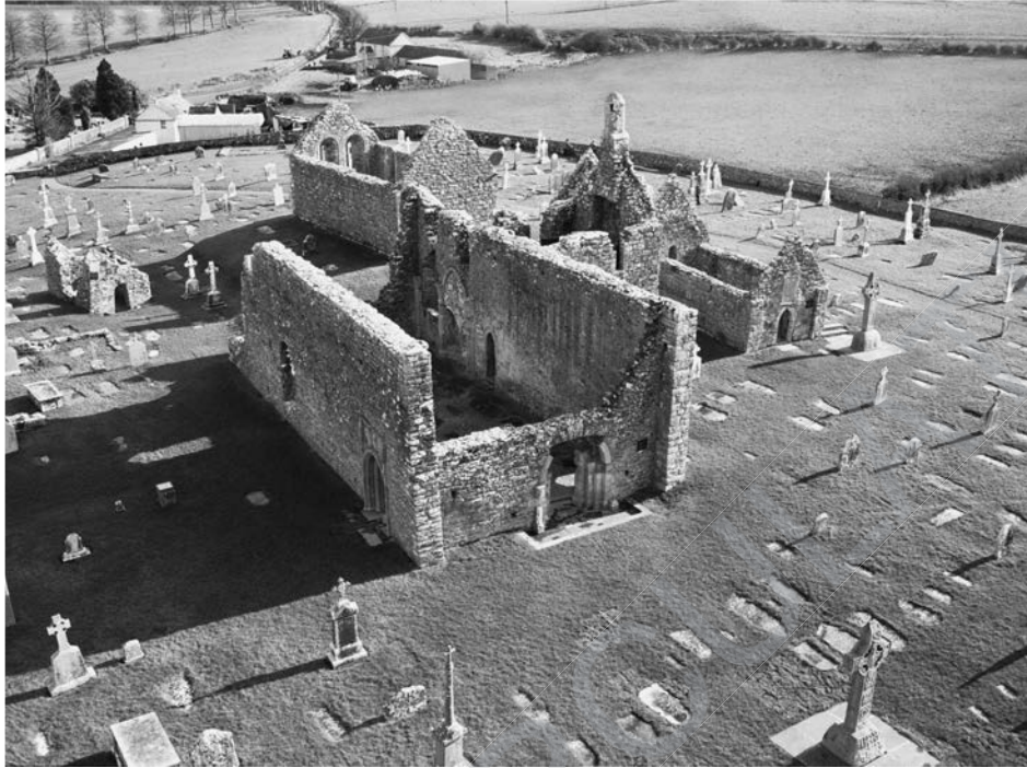
Fig. 6.2. Clonmacnoise cathedral, with the Cross of the Scriptures directly west of it (National Monuments Service, Department of Culture, Heritage and the Gaeltacht).

cathedral. A new high cross was also commissioned, the West Cross, also known as the Cross of the Scriptures, which bears the names of both Flann Sinna and Colmán on its inscription and was thus probably erected at the same time as the cathedral (Ó Murchadha 1980, 48–50). Ó Carragáin has demonstrated that this monument became one of three high crosses that were carefully arranged, or rearranged, to the north, south, and west of the cathedral, so that the axis of the overall scheme inscribes the Sign of the Cross over the building (2010, 44). Clearly, in the early tenth century Flann Sinna was closely associated with this large-scale, innovative, and sophisticated programme of architectural and sculptural development at Clonmacnoise. A similar cruciform arrangement of church and high crosses may have existed at Kells, Co. Meath, a site which also lies within Southern Uí Néill territory, and the patron of this scheme was most likely either Máel Sechnaill or Flann Sinna. Another link between Kells and Clonmacnoise is provided by their high crosses, as it seems the same master-sculptor was responsible for the early tenth-century examples at both sites (Stalley 2007, 159).