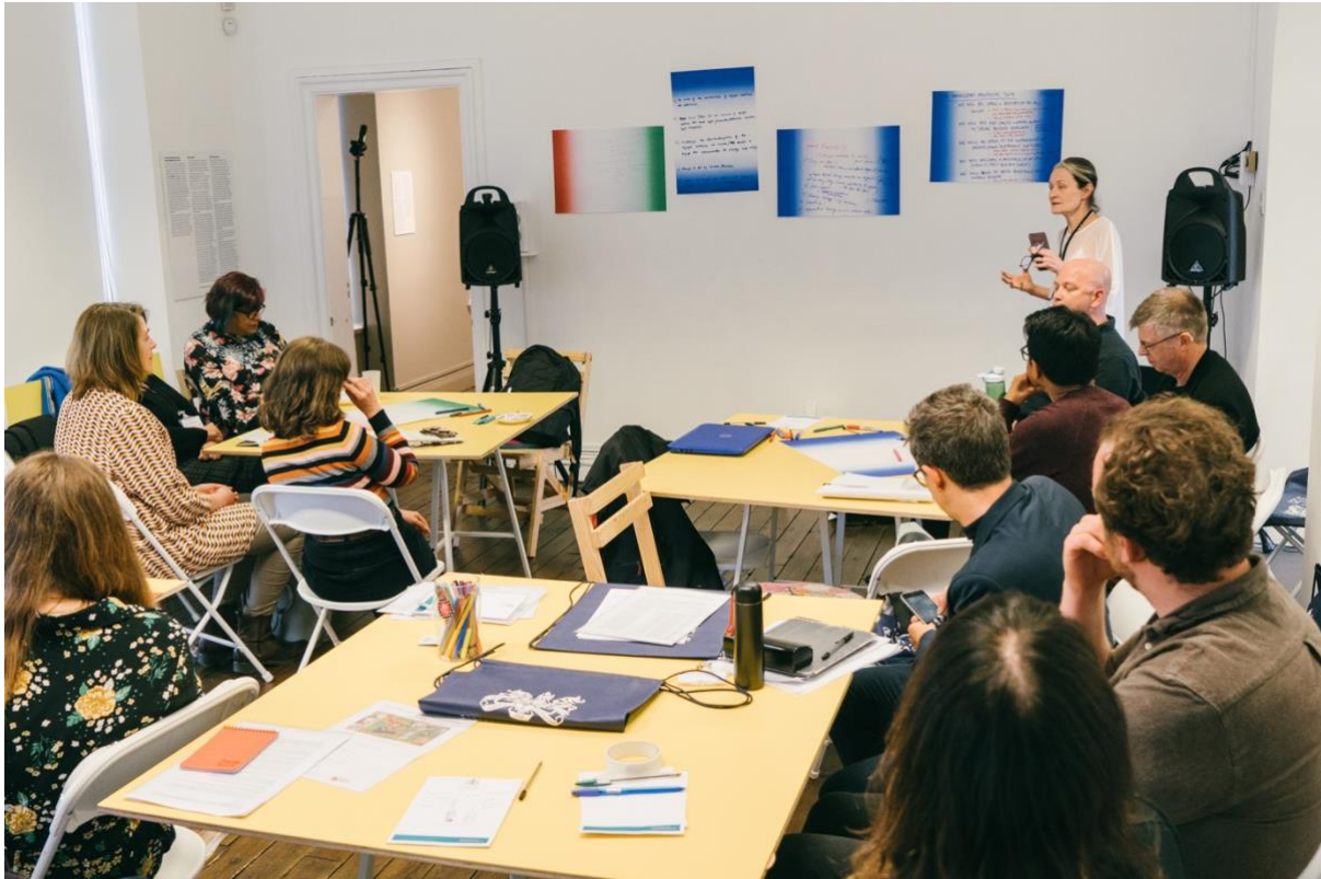
Figure 2: A group of refugee rights activists, NGO workers, service sector workers, academics, artists and cultural leaders discuss art and ethics with a particular focus on refugee experience. Lincoln, April 2019.

In conclusion, we cite the work of collaborators at a recent seminar on the ethical parameters of working alongside people whose lived experience differs from one's own. Participants included activists with lived experience, NGO workers, service sector workers, academics, artists and cultural leaders. The overwhelming outcome was an agreement that stories are personal and precious, but are often manipulated or appropriated. They are not political currency. Sometimes, it may in any case be unsafe for asylum seekers and refugees and those on temporary visas to make themselves “visible”, and the hostile environment that is being promoted in many nation states and regions produces that harsh reality. We found that the power relations between us and across our various statuses as settled or displaced, institutional or freelance, minority ethnic or dominant ethnic, cis or queer, all come to bear on how our stories are heard or understood. We were particularly struck by the manifesto of the RISE organisation of refugees and migrants in Melbourne. Their ten-point plan for people wishing to work “with” them (they address artists, but academics and filmmakers can also take this as good advice) ends with: