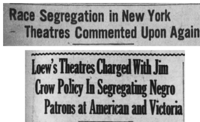
Figure 1: Headlines from African American periodical New York Age . Top: 27 May 1922, 6 (“Race Segregation”). Bottom: 25 February 1928, 1 (“Loew’s”).