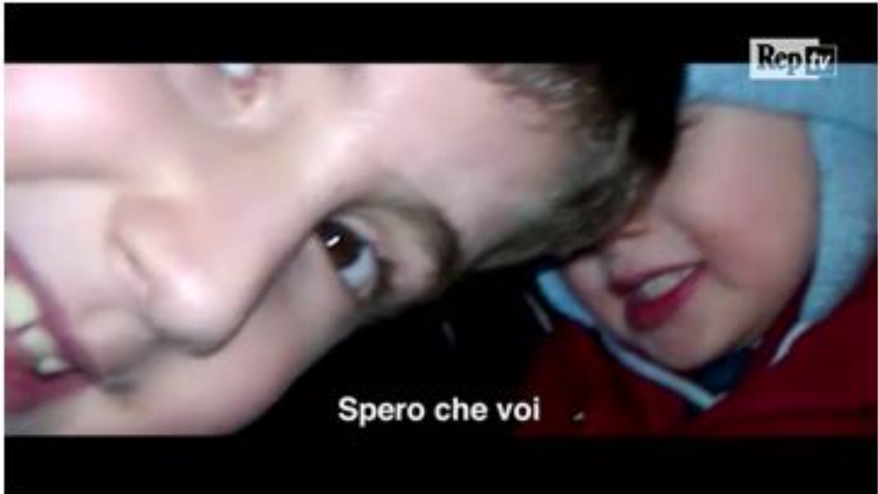
Figure 4: Un unico destino (2017), episode 5. 42° Parallelo , 2017. Screenshot.

Apart from the use of direct interpellation, the web series aims to trigger a process of identification and empathy between viewers and refugees in at least two other ways. The first way again uses the subjective gaze of a body fallen into the sea. However, unlike Com'è profondo il mare , this web series plays on the ambiguity between an authentic document and staged scenes. Although this web series abandons the vertical format, it still simulates the first-person shot taken both on the surface of the water and during an immersion in the murky and threatening waters of the Mediterranean. While some fragments suggest that the videos were shot with smartphones, we may question the fictional reworking of the experience of drowning or sinking because the montage clearly attempts to establish a relationship between the panning shots of tourists, who crowd the beaches unaware of the tragedy unfolding, and the recovery of the memory of what might have been avoided. It is in this way that this disembodied gaze connotes the sea as a space of suspension, traversed by different meanings, but also by distinct time frames: the temporary time frame of vacationing and the irreversible temporality of the dead (see Figg. 5 and 6).