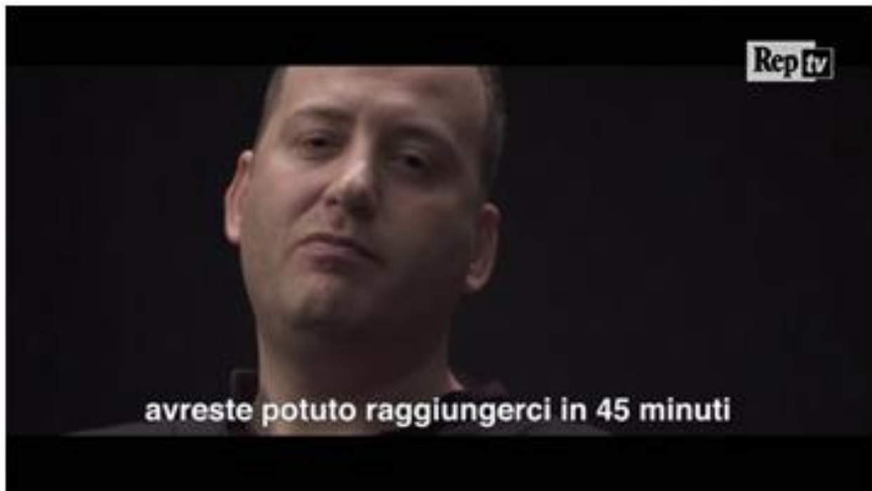
Figure 3: Un unico destino (2017), episode 5. 42° Parallelo, 2017. Screenshot.