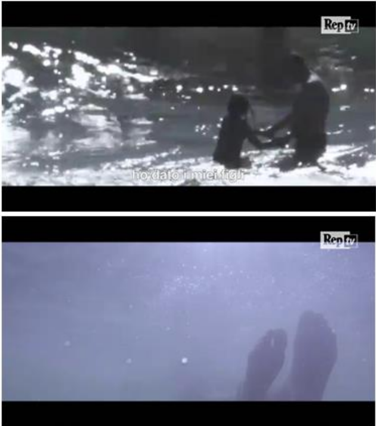
Figures 5 and 6: Un unico destino , episode 3. 42° Parallelo. Screenshots.

The second strategy for securing viewers' identification with the refugees involves the reuse of family videos. These sequences, as well as being interspersed throughout the narrative, mark the conclusion of each episode and link to the credits. Through these private images, the true dramatic power of the event unfolds, because it is wedged in-between moments of happiness and