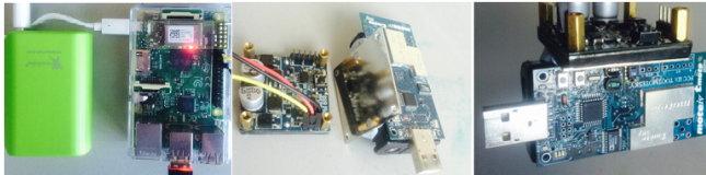
Figure 3. Left: A Pi with a Raspbee. Middle: An EPM device and a Tmote sky (attached with a metal plate). Right: the EPM holding a sensor node with its magnets.

For picking up, carrying and dropping a new node in repairing the network, we use the EPM device (Figure 3). The EPM device, which connects to the PI via the GPIO on the PI, draws the power from there and also receives on/off commands from the Pi for magnetising/demagnetising its magnets to hold/release a new sensor node (for picking up/dropping down a sensor node).