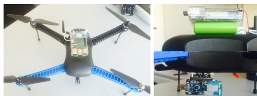
Figure 2. The repairing agent: the Iris+ drone carries the Pi on top and the EPM (with a sensor node) at bottom.

We build our prototype for the repairing agent combining a Raspberry Pi model B+, a Raspbee radio module, an EPM device (electromagnet permanent device) and an Iris+ drone.