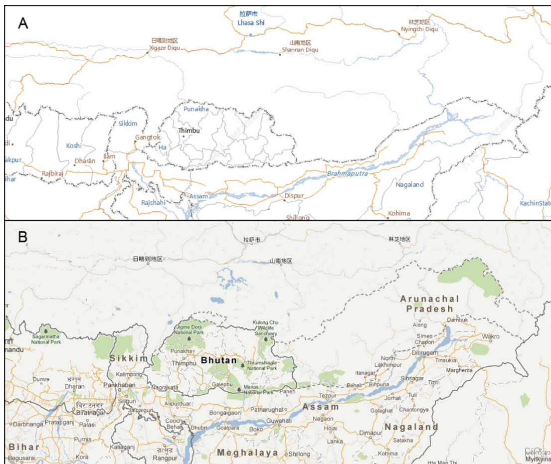
FIGURE 1 A comparison of Arunachal Pradesh as revealed in Tianditu and Google