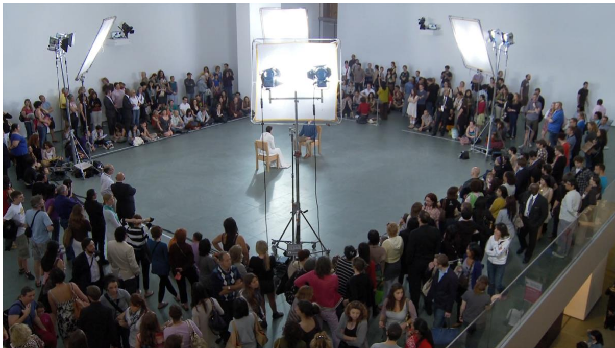
Figure 1: The immediacy/mediation of The Artist Is Present . Dir. Matthew Akers and Jeff Dupre. Show of Force, 2012. Screenshot.

received as a collaborative, affectively intense and ostensibly private moment with Abramović. According to the MoMA press release, each visitor's sitting "completes the piece and allows them to have personal experience with the artist and the artwork" ("MoMA Presents"). And yet, each moment of unfiltered contact was, of course, profoundly mediated. All Abramović's "communers" were embedded within larger sets of curatorial and institutional strategies. Gallery invigilators and security guards were constantly on hand to police the work and preserve its formal and thematic integrity (Abramović's and the gallery's ostensibly shared sense of presence and "stillness"). 2 Despite Abramović's own minimalistic performance, the piece was pervaded by a heady theatricality: an effect enhanced by sets of bright lights, a bevy of cameras and throngs of observers. 3