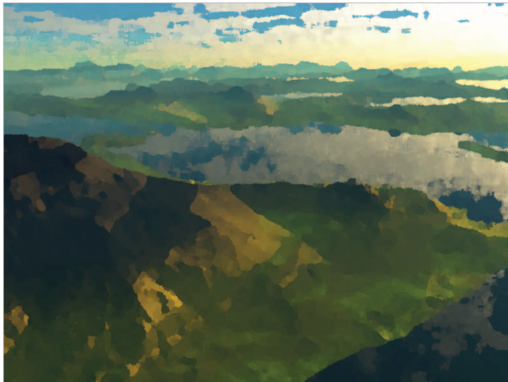
A digital landscape image created by a textural generation system that evolved with computational aesthetic support. (See article in this issue by Prasad Gade et al.)