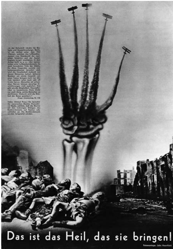
Figure 8. John Heartfield, Das ist das Heil, das sie bringen! ( This Is the Salvation They Bring! ), 1938. © Bildarchiv Preußischer Kulturbesitz, Berlin. © 2008 Artists Rights Society (ARS), New York/VG Bild-Kunst, Bonn

While the seamlessness of German Natural History naturalizes political transformation, the fictional continuity of Das ist das Heil, das sie bringen! ( This Is the Salvation That They Bring! ) of June 29, 1938 (fig. 8), elucidates change by making manifest two phenomena simultaneously. Heartfield has used photographs of airplane stunts to metamorphose into skeletal hands and back again, revealing the militaristic underpinnings of seemingly innocuous aerial acrobatics—the sort one might go see on a Sunday afternoon for entertainment. The exhaust that would normally dematerialize into thin air