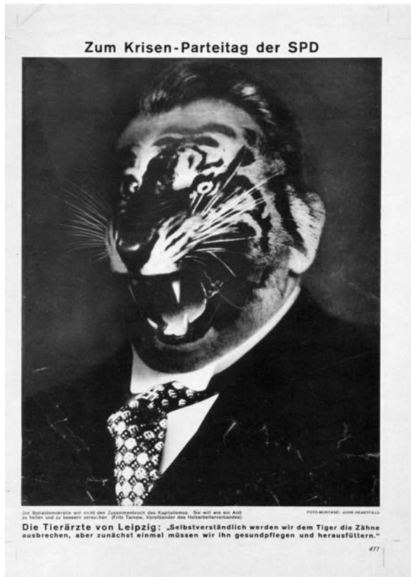
Figure 6. John Heartfield, Zum Krisen-Parteitag der SPD ( On the Occasion of the Crisis Party Conference of the SPD ), 1931. Courtesy Akademie der Künste, Berlin. Kunstsammlung, KS-FS-JH 2520, photograph by Roman März. © 2008 Artists Rights Society (ARS), New York/VG Bild-Kunst, Bonn

pin, insinuating that capitalism, socialism, Nazism, and death are analogous, as interpenetrable as the mutating death's-heads that effortlessly blend into the necktie's fabric. The event that occasioned this nightmarish visage was the 1931 Social Democratic Party conference in Leipzig, whose objective was to come to terms with the escalating world economic crisis. Heartfield's tiger-capitalist, white teeth bared, is an astringent response to the trade unionist Fritz Tarnow's remark: "Social democracy does not want the breakdown of capitalism. Like a doctor, it wants to try to heal and improve it." Tarnow, chair