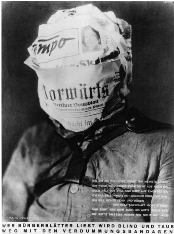
Figure 3. John Heartfield, Wer Bürgerblätter liest wird blind und taub! (Whoever Reads Bourgeois Papers Becomes Blind and Deaf!) AIZ, 1930. Courtesy Akademie der Künste, Berlin. Kunstsammlung, JH-F-467, photograph by B. Kuhnert. © 2008 Artists Rights Society (ARS), New York/VG Bild-Kunst, Bonn

a deliberate rejection of disjunctive form. In this portrait a head, mummified by newspapers, asks its viewers by way of the prose in the lower-right corner: “I am a Cabbagehead, do you know my leaves?” Though inquisitive, the man can neither see nor speak, for he is blinded and muted by the newspapers that wrap themselves over his eyes and mouth, enveloping his head. Nor can he hear, according to the boldface type beneath the image, because “whoever reads bourgeois papers becomes blind and deaf.” The bourgeois press, in this instance, refers to Vorwärts , the press organ of the Social Democratic Party, and Tempo , a mainstream socialist paper. The violence of this image operates not on the register of vicious cut-and-paste but on that of psychological