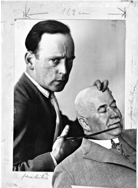
Figure 2. John Heartfield, Self-Portrait with Police President Zörgiebel , mock-up, 1929. Courtesy Akademie der Künste, Berlin. Kunstsammlung, Heartfield 430 © 2008 Artists Rights Society (ARS), New York/VG Bild-Kunst, Bonn

magazines, or Illustrierten , flooding the German market during the 1920s. With a print run of nearly five hundred thousand, it was the second most popular Illustrierte in circulation, outsold only by the left-of-center Berliner Illustrierte Zeitung ( sic ), whose readership extended into the millions. 6 Geared toward a broad-based, left-wing readership, the purpose of the AIZ was to propagate a communist viewpoint to nonparty members and the so-called homeless Left. Its brilliance lay in its ability to speak to the broad spectrum of