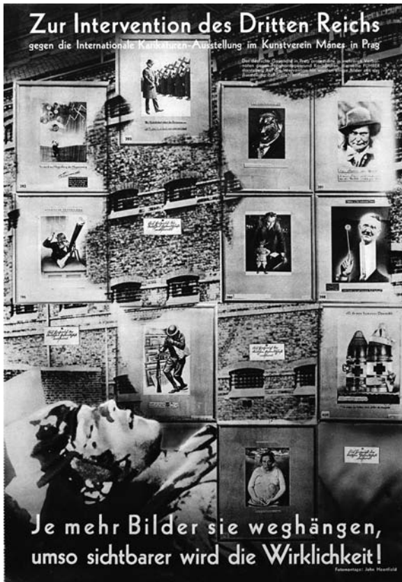
Figure 9. John Heartfield, Zur Intervention des Dritten Reichs ( On the Occasion of the Intervention of the Third Reich ), 1934.

insight, because we cannot transcend our creaturely existence as ideological subjects. To some degree or another, we are all Cabbageheads.