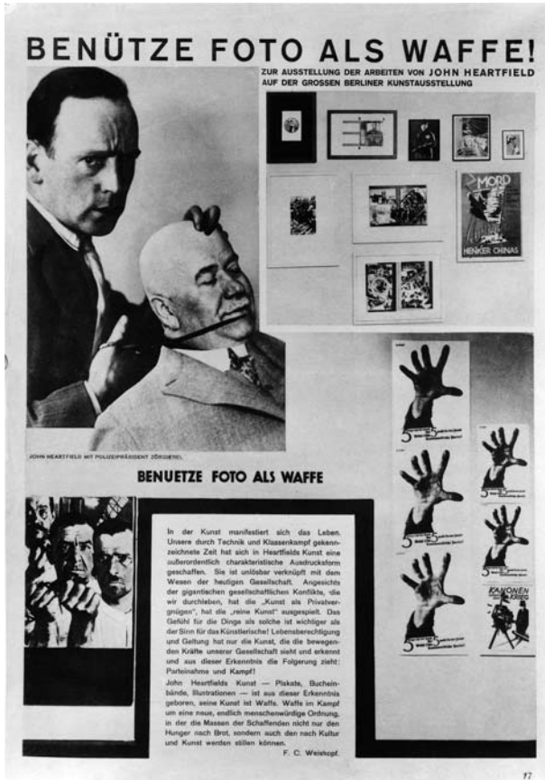
Figure 1. John Heartfield, Self-Portrait , 1929. Courtesy Akademie der Künste, Berlin. Kunstsammlung, Inv. Heartfield 1491/KS-FS-JH 318. © 2008 Artists Rights Society (ARS), New York/VG Bild-Kunst, Bonn

1928, Zörgiebel prohibited all outdoor meetings and demonstrations in response to violent street clashes between and among communists, socialists, and National Socialists. He then extended the prohibition to include the May Day marches, a highly symbolic annual working-class tradition (socialist as well as communist) that demonstrated working-class pride and solidarity. The communists, taking this gesture as provocation by the socialist regime, appeared en masse to protest Zörgiebel's prohibition peaceably, only to be met by specially