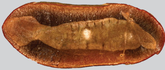
Fig. 4. The holotype of Tullimonstrum gregarium (PE 10504).

In contrast to other famous Lagerstätten, such as the Burgess Shale or Chengjiang, the flora and fauna of the Mazon Creek are largely recognizable but an extraordinary exception is Tullimonstrum gregarium (Figure 4). Discovered in 1955 by a local collector, Francis Tully, and found only in the Mazon Creek Lagerstätte, the enigmatic ‘Tully Monster’ is a popular fossil organism, recognized by the public as the State fossil of Illinois and by its use in advertising campaigns by U-Haul™.