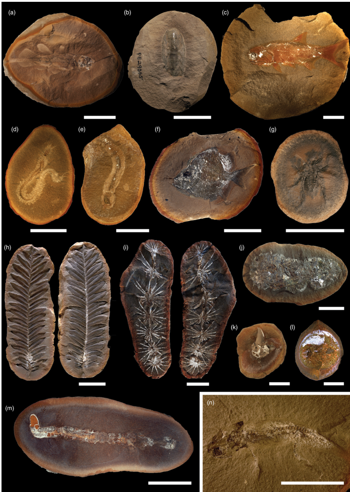
Fig. 3. A selection of fossils within siderite concretions from the Mazon Creek Lagerstätte. (a) Rhabdoderma sp. (ROM56774). (b) Chiton Glaphurochiton concinnus (PE29045). (c) Rhabdoderma ( exiguum ?) (Burpee/Lauer Foundation LF836). (d) Polychaete Esconites zelus (ROM47529). (e) Priapulid Priapulites konecniorum (FMNHPE25135). (f) Actinopterygian Platysomus circularis (FMNHPPF7333). (g) Unidentified trigonotarbid arachnid, most probably Aphantomartus pustulatus . (BMRP2014MCP850). (h) The seed fern Alethopteris sp. (ROM43584). (i) Asterophyllites sp. ROM 43576. (j) Annularia stellate (?) that has been overgrown with sphalerite (LEIUG83622). (k) Chondrichthyan tooth; Phoeboodus ? (ROM56812A) demonstrates, that despite an absence of large fossils, larger animals lived in the Mazon Creek area. (l) Concretion with pyritic core from pit 11 (not accessioned). (m) Holothurian Achistrum ? (P69TG22a). (n) Saurepeton obtusum (ROM56804B). Scales: 20 mm. Accurate locality data for fossils are often sparse, and most are often referred to by the associated strip-mine ‘pit’ number; however, some pits (such as Pit 11) are geographically wide, making this information less useful.