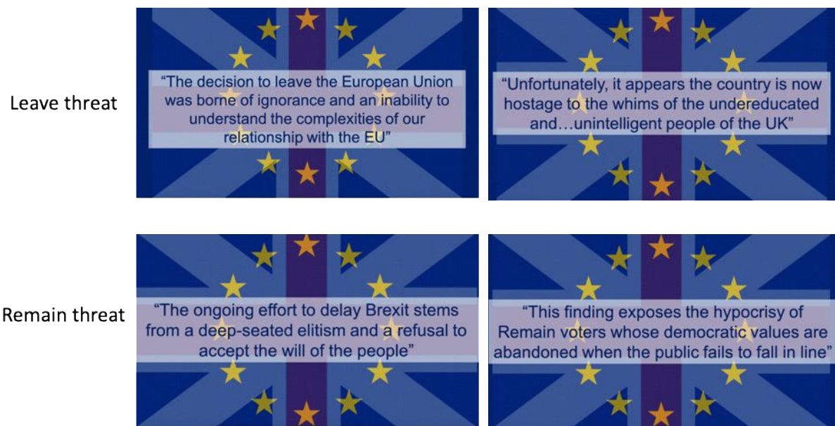
Figure 1. Inflammatory quotes from videos designed to present an identity threat to Leave voters (top row) and Remain voters (bottom row).