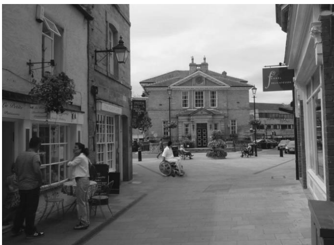
Fig 4. The concept of 'shared space' seems attractive, but presents problems for some users.

One recent and contentious initiative in Europe is the 'Shared Space' concept, whereby urban traffic and pedestrians are not separated by distinct edges (Trinity Haus 2012). The logic is to 'tame' motor traffic on urban streets, relying on courtesy rather than road signs, white lines and traffic lights. Whilst some schemes in the Netherlands and elsewhere have been seen to work adequately, this may be due to the novelty and the politeness of the drivers. For many pedestrian users and cyclists the concept is not appealing; in the UK the National Guide Dogs for the Blind Association has spoken out about this, since people with low or no vision are especially vulnerable. People with limited hearing also find this unfamiliar situation quite inhibiting. This is a case where the street, with changes to its familiar conventions, is suddenly made unfamiliar to an intolerable degree.