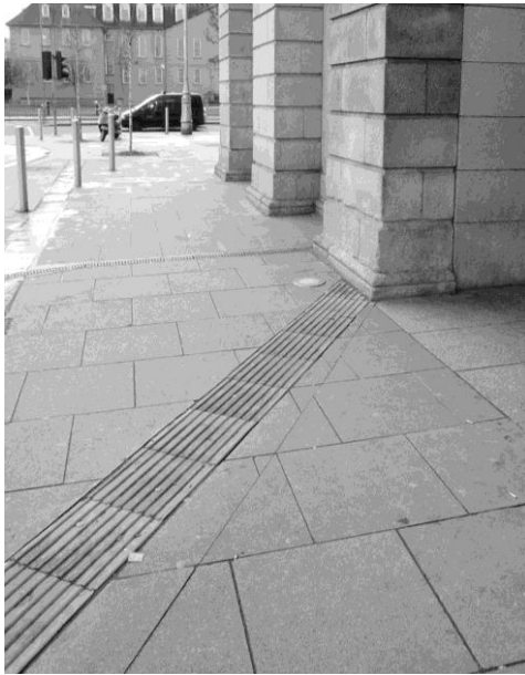
Fig 5. Tactile Strip, Dublin. The designers obviously have little understanding of its use.

Travelling to another country often highlights those apparently commonplace aspects of our environment, even though globalization and travel have brought a high degree of homogeneity in the everyday equipment and facilities that will be encountered; but in Asia, for instance, a Westerner will find conventions that are quite different from home. Traffic may travel on the opposite side of the road and even the way the bathroom is used needs to be explained to the newcomer. Tourism is a major economic factor in many countries and a high proportion of the people who travel are described as 'active-elderly' and though they may have only minor impairments in mobility and vision, well-designed elements in the built streetscape can make their visit more comfortable and safer. Tactile guide or warning strips on footways are there for the benefit of users with vision impairment and can be interpreted like a code, but even this may vary from country to country, or even between cities. Those whose responsibility is to provide such facilities may work from guidelines and standards current in the location, but may not understand the importance of the consistency that is essential to make the user feel comfortable and secure when using these. In Ireland, for instance, it is not unusual to see tactile strips that end in blank walls or flower beds; clearly the designer had little empathy for the people who should be able trust these strips.