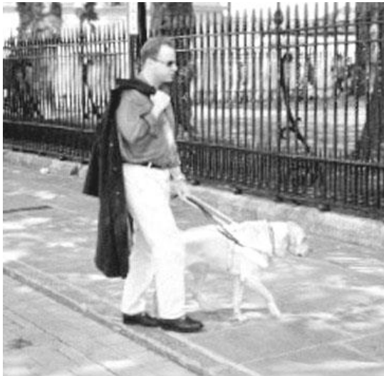
Fig 4. In Europe many blind people use guide dogs to assist them in the public domain.

For people with visual impairment these conventions can be particularly important. Whereas it is relatively easy to impose components for physical access, it is more difficult to design for sensory impairment; the design issues in this field seem to be the most contentious, possibly because it is more difficult for the average architect to imagine the potential problems for this user group. In Europe it is not uncommon for people with vision impairment to use a guide dog to assist them in getting about independently, particularly in the public domain. These fully-trained dogs are taught to recognise the conventions of the everyday built environment, from the kerbs at the edge of footways, pedestrian crossings, steps and doorways. Whereas the human mind can process visual information and make a rational judgement, for the guide dog there is no such refinement. Consequently a short ramp at a pedestrian road crossing, rather than a defined kerb, may not signify the edge of the pavement to the canine brain, with hazardous results as the dog and owner venture into the path of moving vehicles. In this way it might be said that the limits of universal design extend to non-human users!