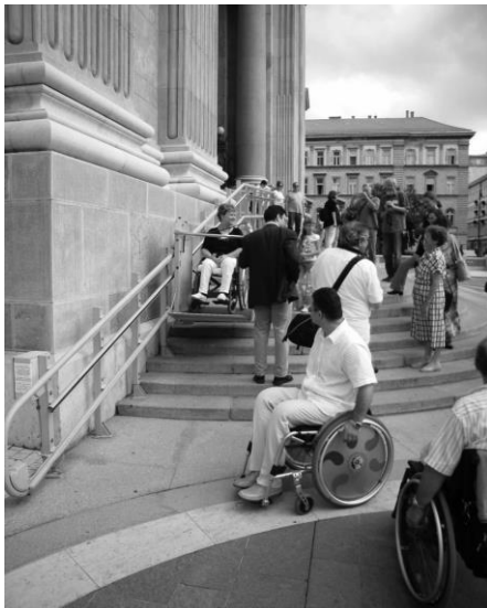
Fig 2. Many access features are added on to older buildings, which would not be acceptable in new-build

Attitudes to people with disabilities have improved in recent years, but there is still some reluctance among architects and building owners to invest in facilities to make the buildings more user-friendly, either for reasons of cost or in the mistaken belief that this will hamper the aesthetic quality of the end product. In all European countries, including the United Kingdom and Republic of Ireland, comprehensive and enforceable access legislation is in place to promote and enable independent living, along with safety and accessibility. In addition, much information on the interpretation and extension of these codes is available for designers; in fact the proliferation of web publications from both government and other institutions can be quite bewildering. Sources for designers that are both comprehensive and comprehensible are valuable, since legislation , defining what must be done, and best practice , demonstrating with examples of how best this can be achieved, are not the same thing.