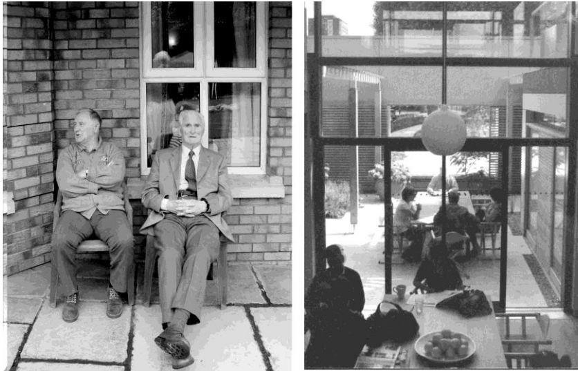
Fig 3. The home environment is familiar, both in personal and family/communal spaces.