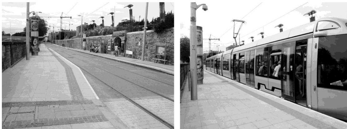
Fig 1. Dublin's Luas tramway: the built environment and mobile system interface.

Universal Design and Inclusive Design have now gained wide acceptance as similar concepts, even where there may be limited evidence of it being put into practice in the built environment. Although building codes require significant elements of construction to be made barrier-free, it is much more difficult to legislate to make a more comprehensive and 'joined-up' environment overall. And yet the very real problem for many people is often that some of the important parts of the accessible environment may not connect at the interfaces; this may be because separate elements are provided by different agencies and are governed by different codes. A clinic, for instance, may have different standards to the dwelling place; public buildings may be accessible and usable by people with a range of disabilities, whereas the road system is the responsibility of another authority, with its own standards, and then the bus service operates in a completely different way. Thus the simple narrative of a person going to a clinic will be subject to standards and constraints that vary quite widely. The roads or footpaths that they walk or drive on are relatively permanent, subject to some degree of maintenance, whereas the public transportation system changes all the time; vehicles have different specifications and the personnel who operate them need to be properly trained to sustain a vital degree of user-friendly service.