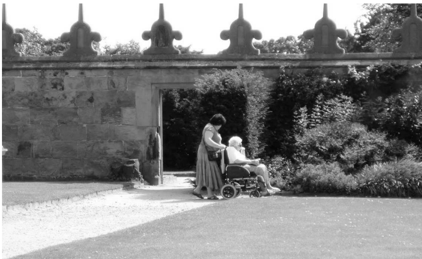
Fig 3. In an unfamiliar setting we rely more on conventional design and wayfinding symbols.

In assessing the success and limitations of Universal Design in the built environment, and to postulate how and where it may be extended or further improved, it is useful to consider one of the most fundamental factors about the way we use our world. For almost everyone, except the housebound (and they are a cohort we shall later consider), there are two distinct worlds that we inhabit. Our familiar, home or 'everyday' living space: our dwelling, workplace, the pavements we use to connect with the bank, post office, shops and everything that we use regularly. And these may be further divided into the more personal zones which have been used and tailored over time by ourselves, our families and those we share that space with, and the other places we use regularly and have learned to use for our own comfort, safety and security. For those who need them, fixed assistive devices may be appropriately installed, ranging from handrails to powered stair lifts.