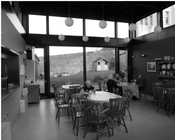
Fig 6. A centre for dementia patients needs special attention in design.

Models of person-environment interaction have shifted in recent years, across disciplines, and can be best described as transactional, where the person is seen as being "embedded" in their total environment, and in a state of constant interaction. Understanding that this a more elaborate way of making the statement that "good design enables; bad design disables", how then can improved design, and especially emerging technologies, extend the limits of usability of anything that is designed, in both the public and the individual domains?