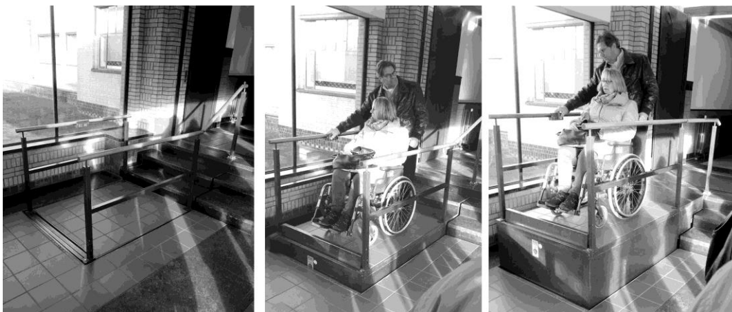
Fig 4. Platform lift in a museum returns to a usable stair when not used for wheelchair access.

Design solutions may apply current technology in two ways: firstly we can use various communication devices, such as sensors and the kind of applications ('Apps') that are used extensively on mobile phones, Bluetooth or RFID (Radio Frequency Identification) with proximity sensors as used for audio guide handsets in museums and art galleries. These can be located to activate existing parts of the building, such as opening doors, switching lights or providing information of any kind. Through the use of wearable sensors the services can be designed to respond to the individual needs of the building user, rather than just for people in general. We are all used to the automatic door openers on public buildings, but these are not selective; for a more limited range of users the door might only open to individuals who carry some form of identification, which may be preset to inform the system of their personal needs (Harrison & Dalton 2011).