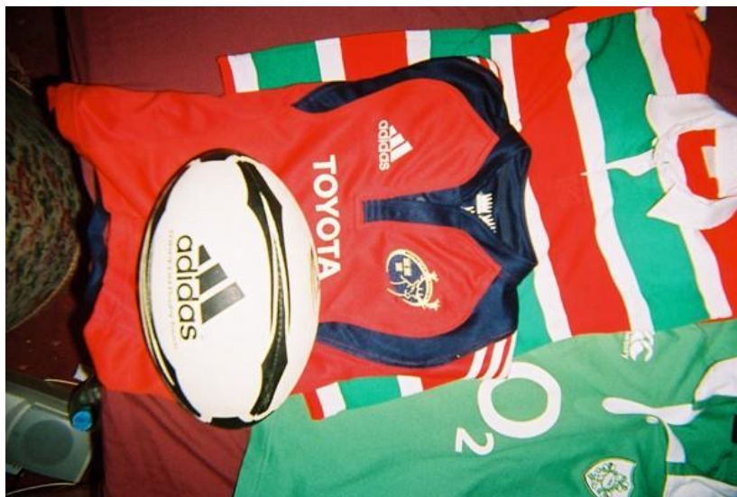
Figure 6.1: ‘My rugby shirts’, by John, aged 11, moved from England

one of a number of shirts, while pride of place is afforded to his Munster 13 shirt (see Figure 6.1).