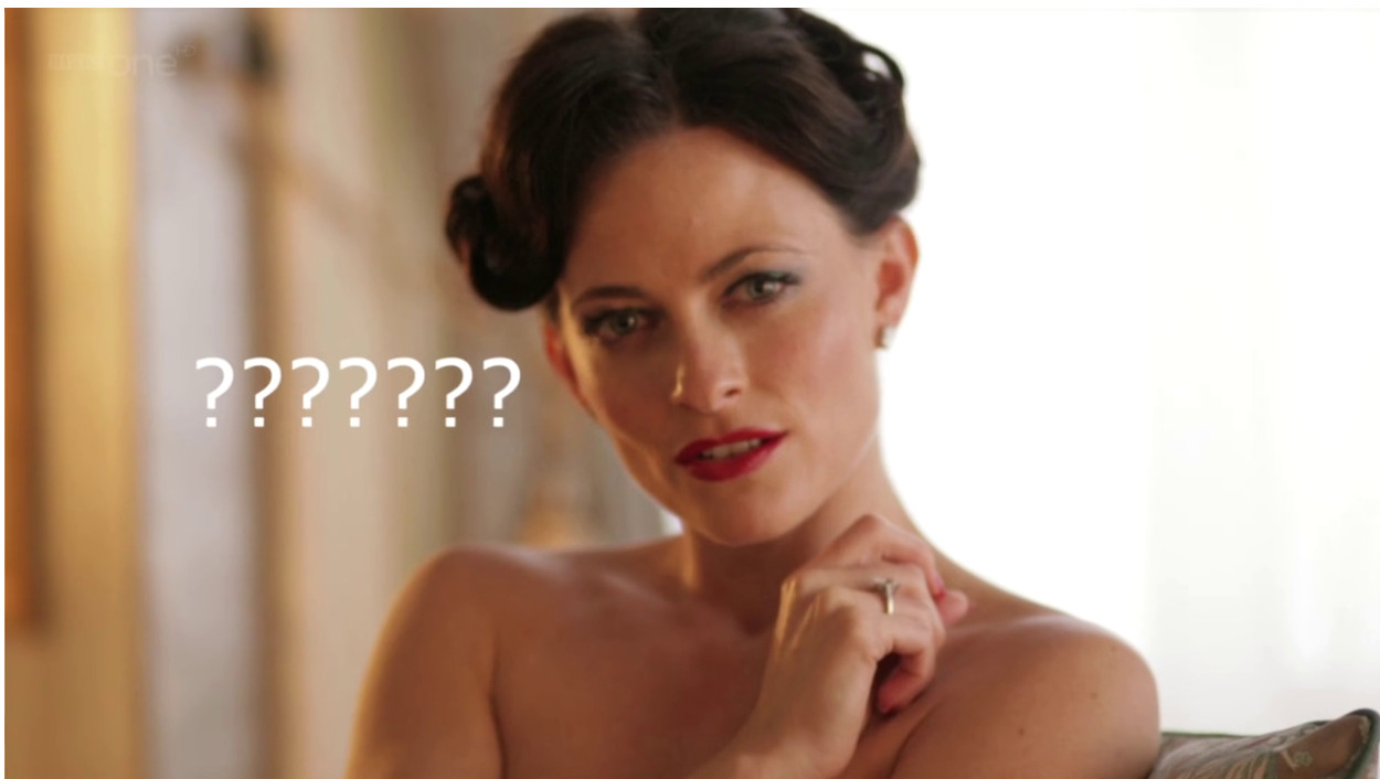
Figure 4: Woman as absolute Other: Irene Adler (Lara Pulver) in Sherlock . "A Scandal in Belgravia." Written by Steven Moffat, directed by Paul McGuigan, BBC Wales, 1 Jan. 2012. Screenshot.