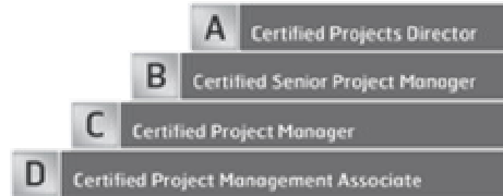
IPMA Certification Model

Our analysis examined live and projected certificates on the registers of the PMI and the IPMA for 2008.