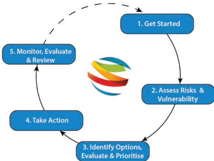
Fig. 7.2 CLIMATE project best practice adaptation planning model