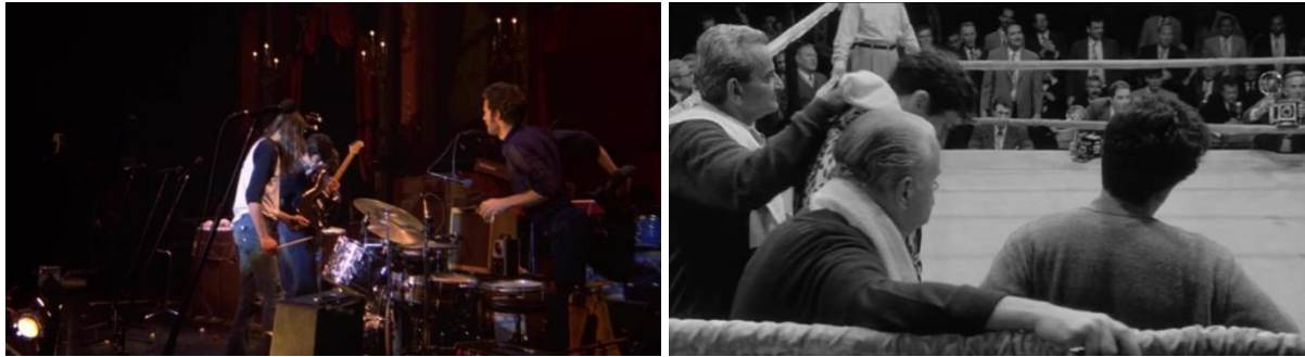
Figures 3 (left) and 4 (right): In the ring: Scorsese’s filming of The Last Waltz —staying on stage with the musicians even between numbers (“like boxers between rounds”), catching the audience only peripherally if at all—gave the director a framework for filming Raging Bull . The Last Waltz , United Artists, 1978. Raging Bull , Chartoff-Winker Production, 1980. Screenshots.