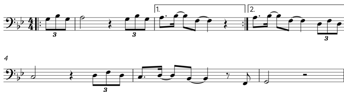
Figure 5: Conventionalised melody of “The Theme from The Irishman .” Robbie Robertson, Masterworks , 2019.

Example 1 shows an abstracted form of the tune, with the spaces between the phrases “normalised” to a downbeat phrase structure. In fact, it is the tension between this implied phrase structure and the steady rhythm section that provides a great deal of the theme’s sense of tension and foreboding, heightened by a complementary melodic/harmonic drive. The simple melody is in G Dorian (minor) mode. There is, strictly speaking, no vertical harmony in the piece, as the pitched instruments carry the melody over the almost subliminal, rhythmicised pedal G from the guitar. Each A and B phrase contains two brief, related phraselets paired in a call-and-response pattern, where the response extends the “call” by tumbling downward. The A section rests heavily on the second of the scale, creating tension between the G pedal and the note above before dropping to the \flat 7 of the scale, the note below that pulls upward into resolution to the final.