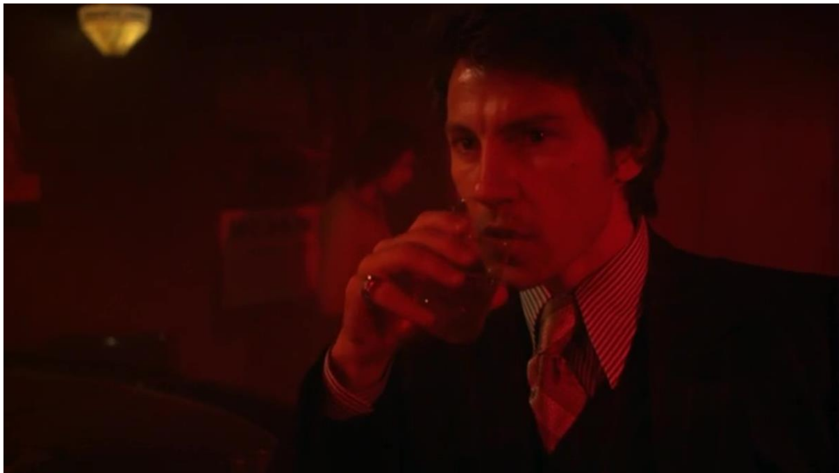
Figures 1 (above) and 2 (below): Charlie watches Johnny Boy enter the bar to “Jumping Jack Flash” by the Rolling Stones. Mean Streets , dir. Martin Scorsese. Warner Brothers, 1973. Screenshots.

This musicality was one of the main reasons that, in 1976, Robbie Robertson, then guitarist and primary songwriter of the seminal rock group The Band, asked Scorsese to film a record of The Band’s final concert, with many notable guests, including Bob Dylan, Joni Mitchell, Neil Young, and Van Morrison. The resulting film, The Last Waltz (1978), is not simply one of the most highly regarded concert films in history; it impacted Scorsese’s career in two interconnected ways: filming the musicians gave the distinctly nonathletic Scorsese a view on how to film the fights in what would be his next film, Raging Bull (1980); and he and Robertson would become close friends and collaborators.