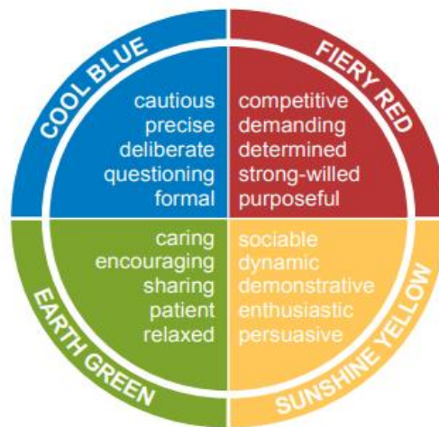
Figure 1. Colour personality mapping

Each person is a unique combination of these four colours, which determines one’s personal style and behaviour at work. The students had to complete a short questionnaire, reflect on their strengths and weaknesses based on their unique colour profile and finally share their profile with their group as well as the lecturer, in order to help others to understand their personality and work together in harmony. The results are provided and discussed later.