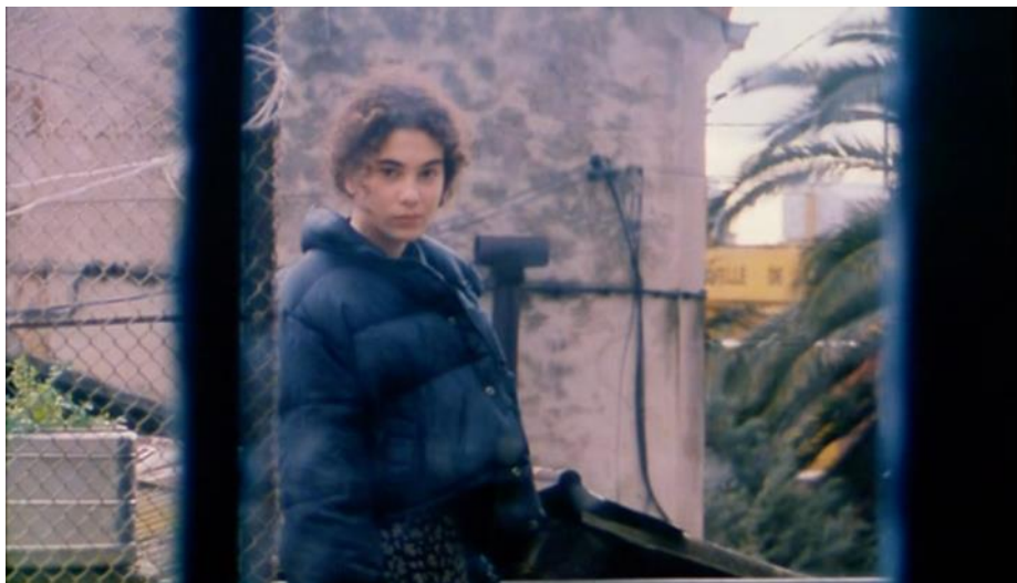
Figure 3: Nenette enters Boni's home. Nenette and Boni . Directed by Claire Denis. Dacia Films, 1996. Screenshot.