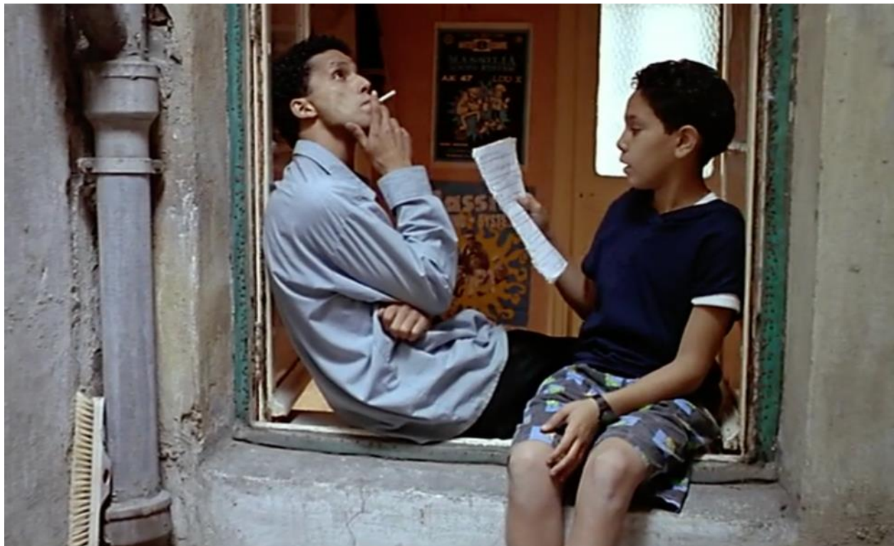
Figure 1: A porous old home in Bye-Bye . Directed by Karim Dridi. ADR Productions, 1995. Screenshot.