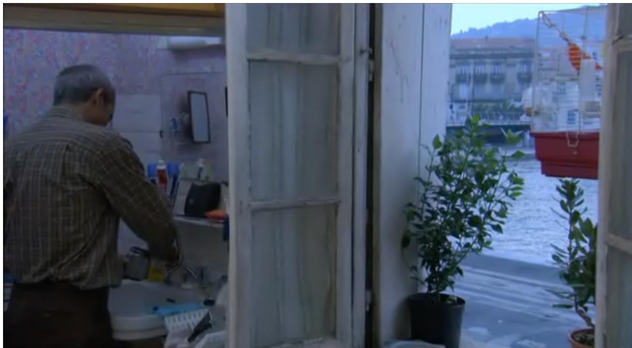
Figure 4: A room by the canal in The Secret of the Grain ( La Graine et le mulet ). Directed by Abdellatif Kechiche. Pathé Renn Productions, 2008. Screenshot.