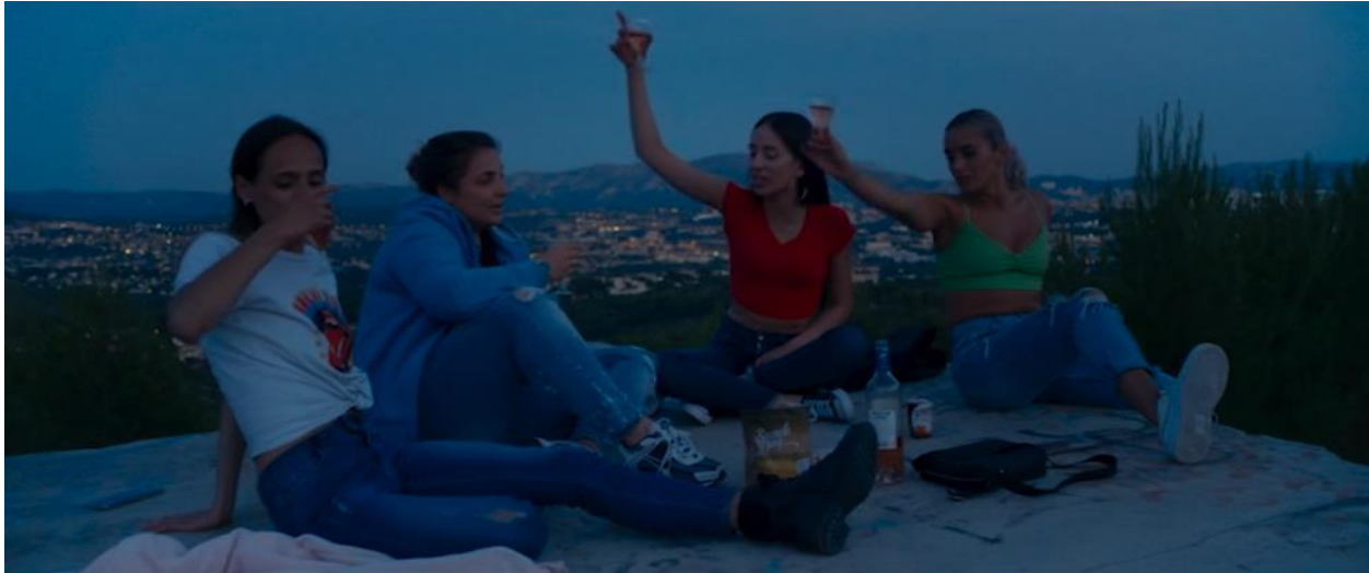
Figure 8: Good Mother ( Bonne mère ). Directed by Hafsia Herzi. SBS Productions, 2021. Screenshot.