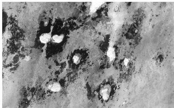
Figure 2. Photograph of the Corroded Plate

For each of the combination of luminosity, contrast and noise, the image processing based detection of corrosion is carried out for automatically computed gray-level threshold and for heuristically fit gray-level threshold. Figure 3 illustrates the adjustments of the gray-level threshold required for various images corresponding to various environmental conditions. The non-adjusted threshold values refer to that obtained from Otsu's method, while the adjusted values correspond to the values obtained from heuristic thresholding. It is observed, that for certain combinations of luminosity, contrast and noise the heuristically set thresholding is significantly different from that obtained by automatic thresholding.