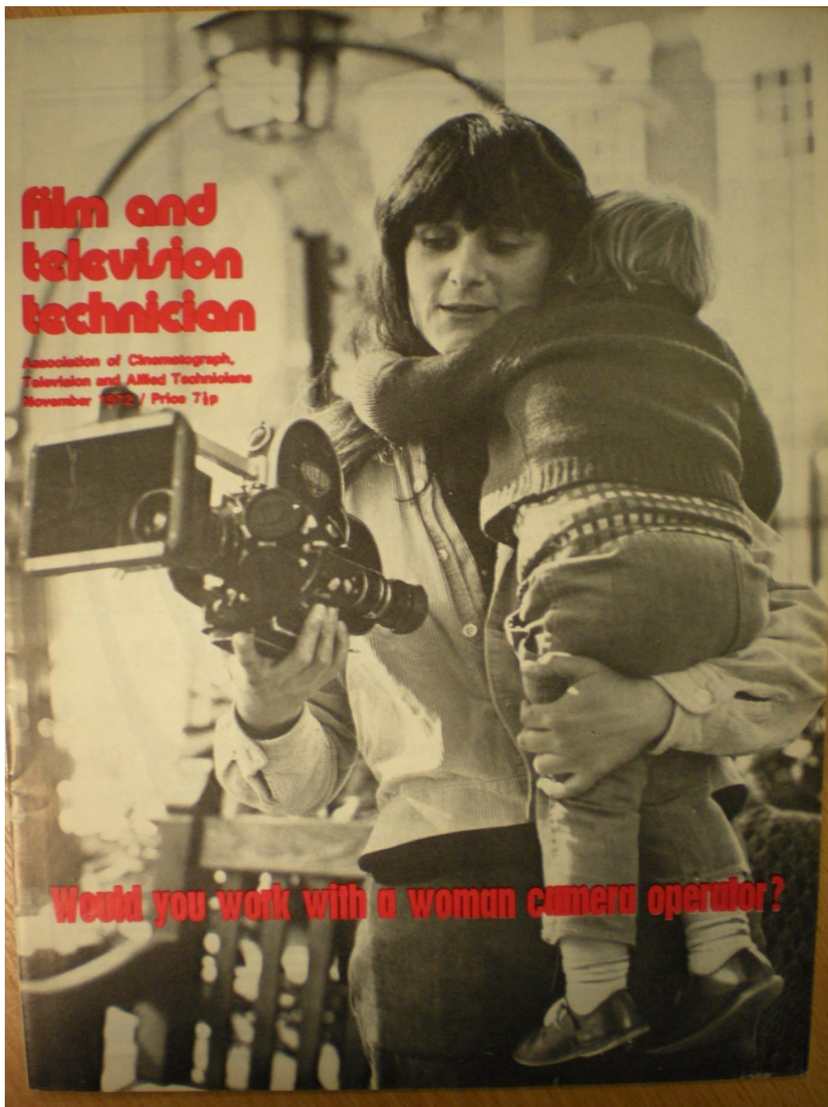
Figure 1: Front cover of Film and Television Technician (November 1972) featuring a female camera operator holding a camera in one hand and a small child in the other, with the caption “Would you work with a female camera operator?”

The issue featured three articles on gender discrimination in the film and television industries, including an article by Women in Media—a campaign group established in 1970 by women in