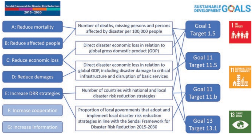
Fig. 2.2 Correlation between Sendai Framework global targets and SDG global targets through common indicators.

risk reduction cuts across different aspects and sectors of development. There are 25 targets related to disaster risk reduction in 10 of the 17 Sustainable Development Goals, firmly establishing the role of disaster risk reduction as a core development strategy with connections to resilience (PreventionWeb, 2019; UNISDR, 2015a). Equally synergies exist between climate action and the SDGs for resilience (UNDESA, 2019). For example, energy transitions envisaged in SDG 7, sustainable industrialisation under SDG 9, sustainable food production systems and resilient agricultural practices under SDG 2, and changing patterns of consumption and production in line with SDG 12 can all contribute towards resilience. However, in the case of climate adaptation, synergies with other agendas have tended to be oriented towards specific sectors.