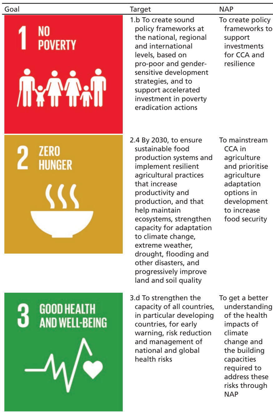
Table 2.3 Examples of correlation between the SDGs and National Adaption Planning as a component of the Paris Agreement