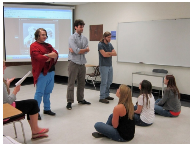
Figure 3: Student directing presentation on Dornröschen

to our usual acting/directing warm-up, but this time integrated everyone's gestures. In discussion, we then reflected on the connections between the play's themes and satirical impetus and the students' gestures. The capstone to our consideration of Jelinek involved a multimedial directorial assignment due on the third day. I tasked students to create a voice recording of a passage or a collage of citations in two different voices and provide an image that they associated with the text. After posting their voice recording, they were required to compose directions for a choreographed sequence with three female and three male actors (3 princes and 3 princesses) that would be performed simultaneously with their voice-over recording, a projection of the image they associated with the text, and a song or soundscape of their choosing. In the following class session, each student presented their multimedial interpretation of Jelinek's text by directing others from the class. Over the 75 minute session, we witnessed a wide range of critical reflections on Jelinek's text. Each student was able to employ a wide range of theatrical signs in an interpretation that emphasized neither character nor plot, but rather the theater as a canvas for representation and reflection beyond drama.