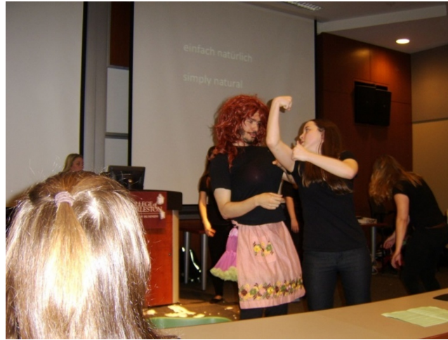
Figure 4: The group's Dornröschen staging in the final performance