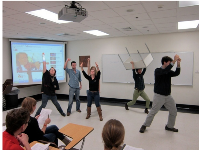
Figure 2: Student directing during an acting warm-up (tableau: revolution!)